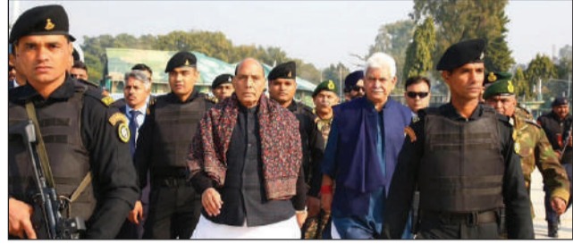
Rajnath Singh on Wednesday said he had full faith in the Indian Army that | More on P6

Says He Is Confident Army Will Wipe Out Terrorism From J&K