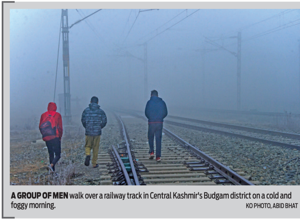
A GROUP OF MEN walk over a railway track in Central Kashmir's Budgam district on a cold and foggy morning.

sued by Additional District Judge Jammu and was to be produced in the court last Friday. Sources said the case was related to a money dispute. He was shifted to a community health centre (CHC) at Jorian as he was not responding, where doctors declared him dead, the spokesperson said, adding a magisterial inquiry has been ordered by Deputy Commissioner Jammu. The post-mortem was conducted by a board of doctors in GMC Jammu in the presence of the magistrate and videography has also been done, the spokesperson said. Sources said the entire premises including the lockup of police post Jorian, are under CCTV surveillance.