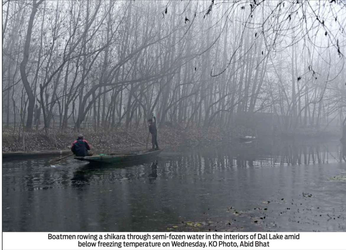
Boatmen rowing a shikara through semi-frozen water in the interiors of Dal Lake amid below freezing temperature on Wednesday.

and Obstetrics admissions, totaling 89,973 admissions. Hospital performance indicators revealed an average daily admission of 246, with a bed occupancy rate of 81 percent. The gross death rate was reported at 3.8 percent, while the net death rate stood at 1.83 percent.