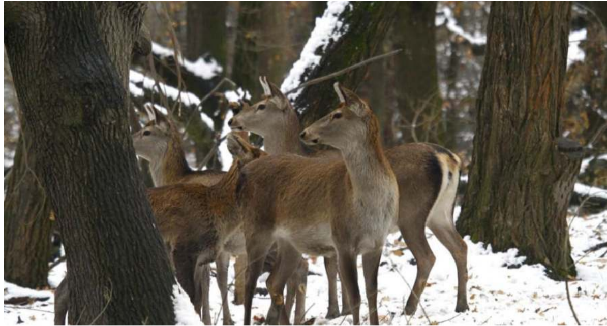
Wildlife Department, Kashmir

According to a report of Department of Wildlife Protection, Jammu