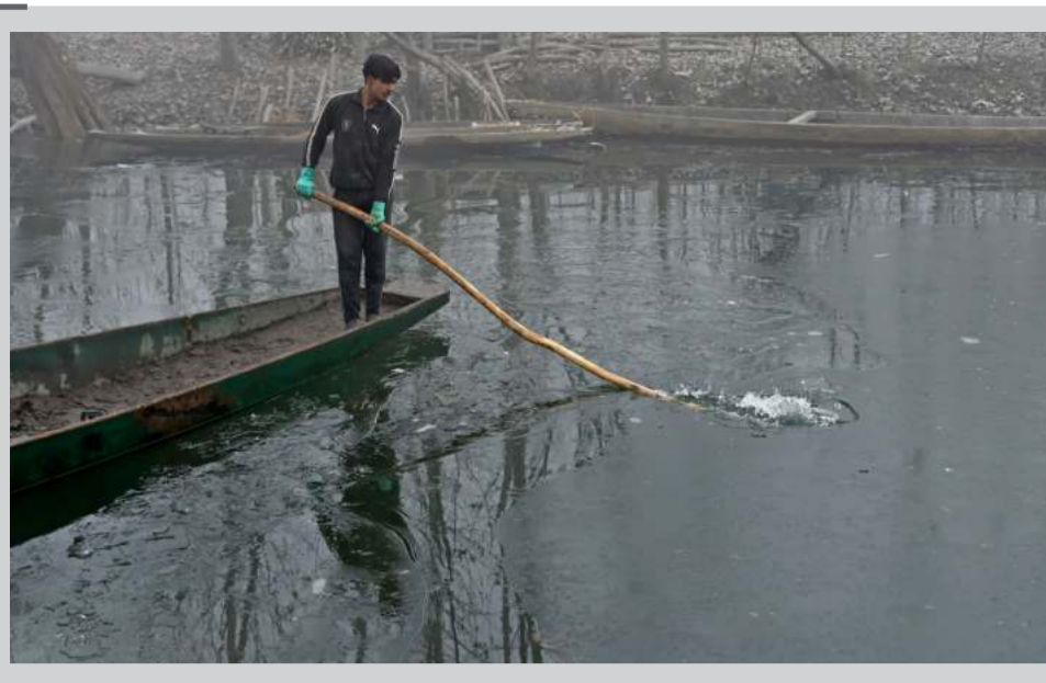
A MAN BREAKS ICE to make a way for his boat inside a water body in Ganderbal district of Central Kashmir.

Press Trust Of India BSF and has been serving for the past 24 years now he says that he has got brother's death in return to his services to the nation," Abdullah told reporters here. He added, "The Army Chief has taken Northern Command-er also from here to the academy in Dehradun but it will not resolve the problem. There should an investigation into why this happened?" If innocent people who have nothing to do with terrorism are killed "which India are we living in", he asked. "Is this Mahatma Gandhi's India where we can live in peace? The hatred has spread so much that Hindus and Muslims think they are enemies of each other." The former chief minister trashed the BJP claims about end of terrorism in Jammu and Kashmir. "Four years ago, the Home Minister made a speech in Chennai where he said Article 370 was responsible for terrorism in Jammu and Kashmir. Now terrorism will finish in JK and development is being done."