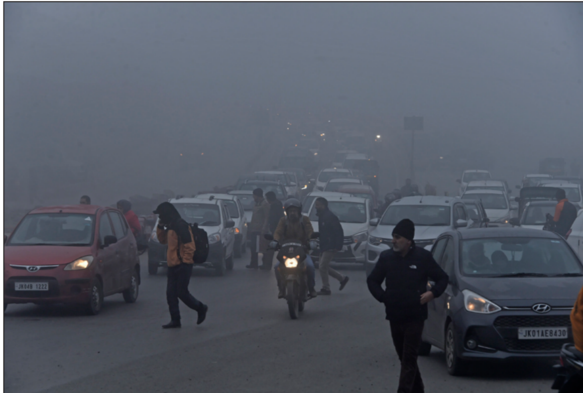
Heavy traffic snarls were witnessed in parts of Srinagar amidst the dense fog cover, affecting the normal life in the summer capital on Tuesday.

One of the focal points of the presentation was the successful revitalization of Dal Lake Front, where a continuous 5.10km cycle track has been established along the pristine lakeside. This development has significantly enhanced the appeal of the Dal Lakefront, attracting numerous visitors well into the late evening, and contributing to its newfound vibrancy.