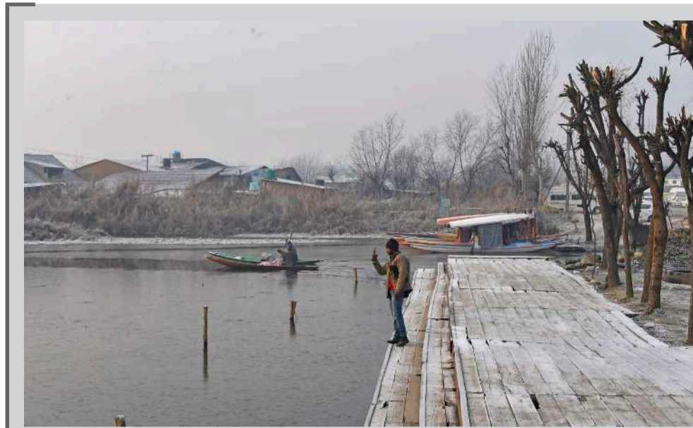
A TOURIST CLICKS PICTURE of a frozen water channel of Srinagar's Dal Lake on a cold Thursday morning.

It was informed that J&K has taken many proactive steps to ensure sufficient availability of power as a part of both short term and medium term measures.