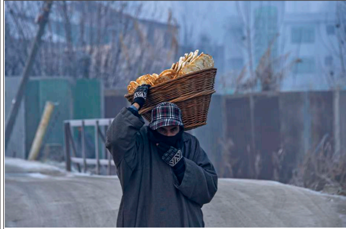
A man carrying on his head a willow basket filled with Kashmiri (Tchot) morning medium-sized round bread for clients to purchase amidst early morning chill.

This festival not only celebrates the craftsmanship of the region but also anticipates attracting winter tourists, contributing to the local economy and providing valuable opportunities for local artisans to showcase and sell their products.