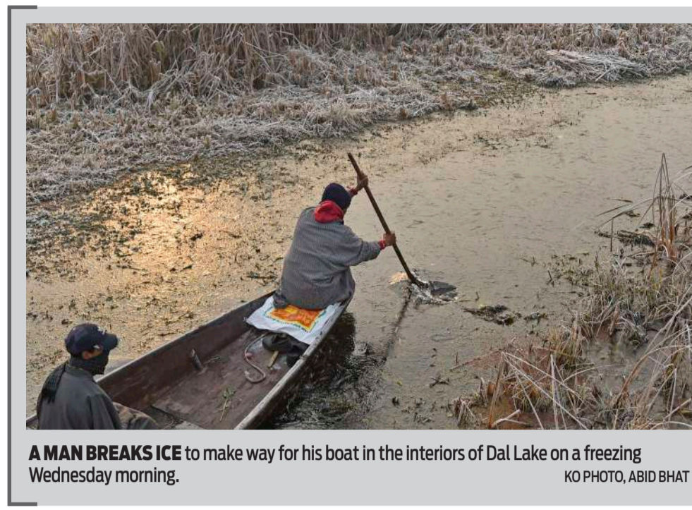
A MAN BREAKS ICE to make way for his boat in the interiors of Dal Lake on a freezing Wednesday morning.

Chief Secretary also listened to grievances of several delegations and gave on spot instructions for their resolution and early disposal.