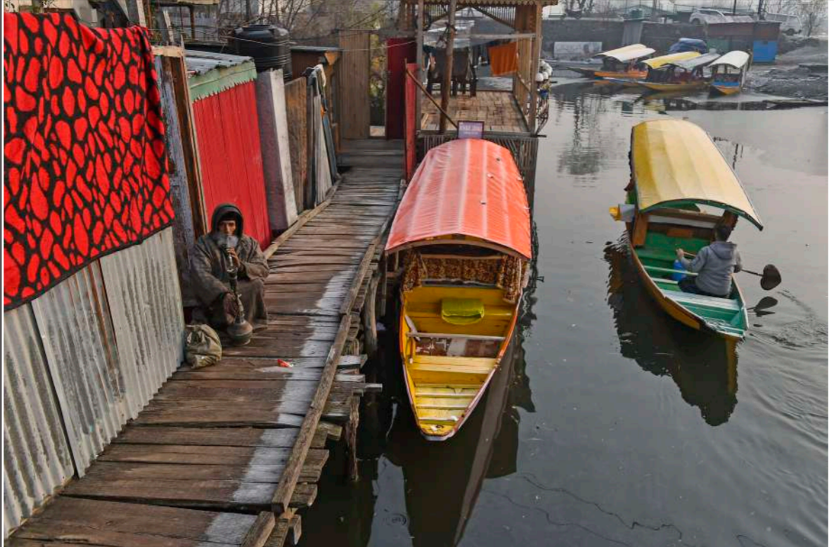
Clad in (Pheran) a traditional Kashmiri winter attire, an elderly man enjoying hubble-bubble in Dal Lake amidst intense cold on Wednesday.