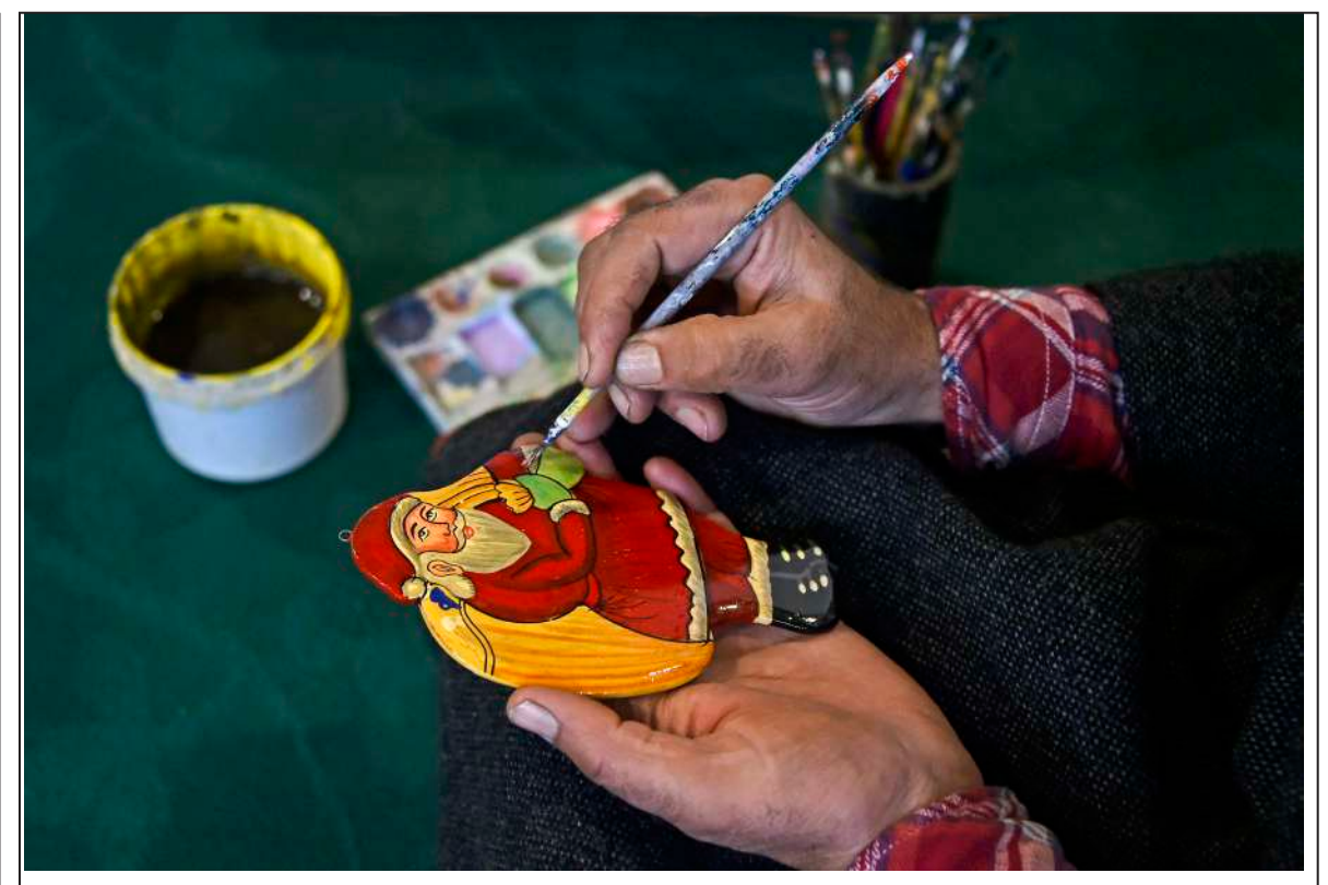
Christmas Crafts A Srinagar-based artist is busy making a santa-claus statue ahead of Christmas celebrations amidst intense cold on Tuesday.

The Viksit Bharat Sankalp Yatra campaign stands as a testament to the govern-