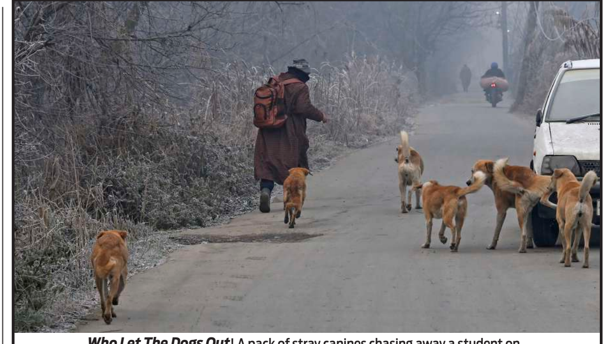
Who Let The Dogs Out! A pack of stray canines chasing away a student on way his home in Srinagar on a cold Thursday morning.