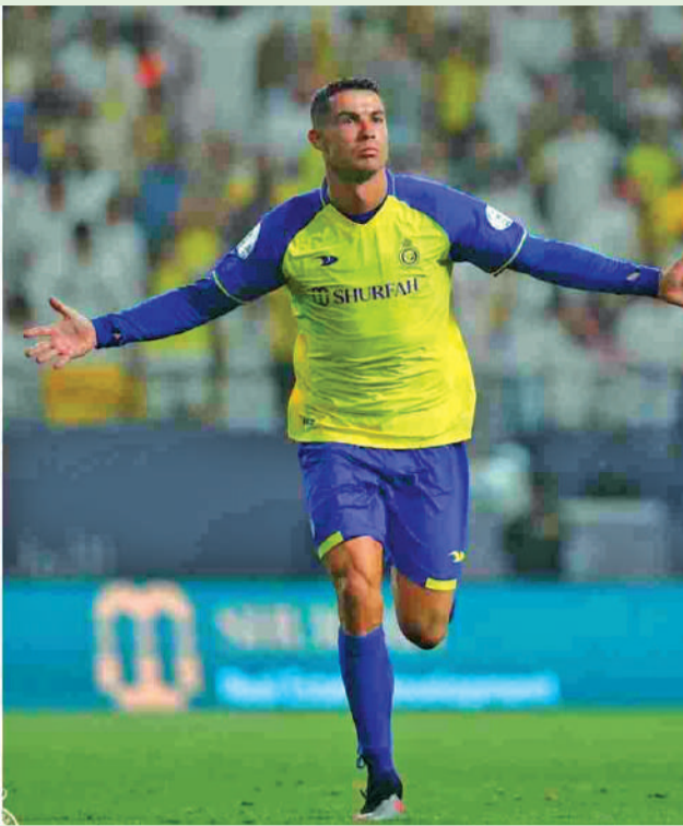
20 goals and one assist.

Messi and Ronaldo have faced off 35 times between matches for club and country, Inter Miami said, with Messi's teams winning 16, Ronaldo's teams winning 10 and the sides settling for a draw on the other nine occasions. Messi has 21 goals and 12 assists in those matches; Ronaldo has