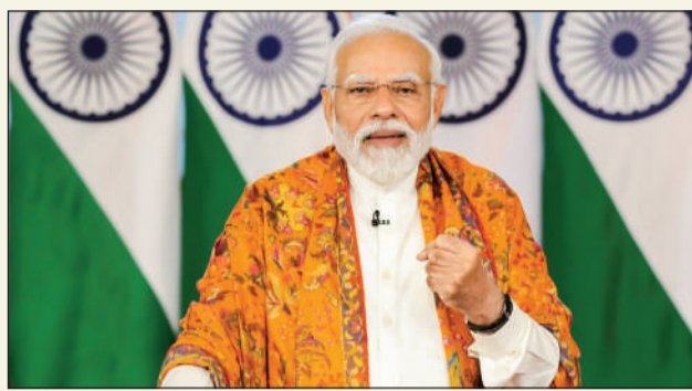
WITH ITS VERDICT, THE SUPREME COURT HAS STRENGTHENED the spirit of Ek Bharat, Shreshtha Bharat"

The prime minister said he was crystal clear about one