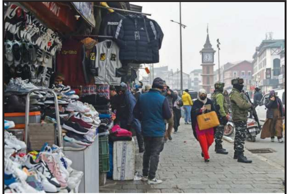
Normal business activities in city center Lal Chowk remained unaffected amid heightened security arrangements as Apex Court pronounced its verdict on Article 370 on Saturday.

Kabli said the expected influx is significant. "We expect around 10 to 12 lakh birds," he said.