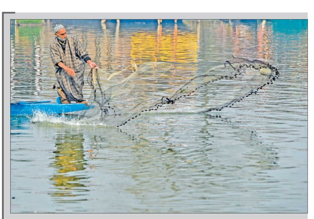
A FISHERMAN CASTS his net inside Srinagar's Dal Lake on a cold Friday afternoon.