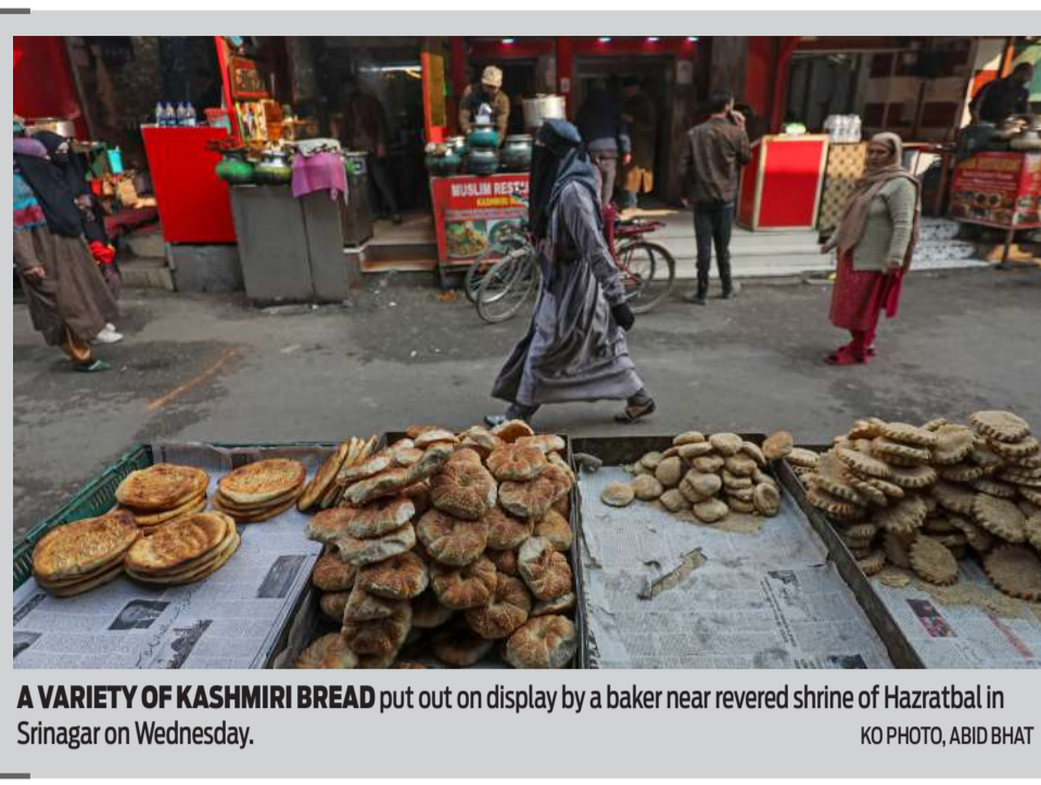
A VARIETY OF KASHMIRI BREAD put out on display by a baker near revered shrine of Hazratbal in Srinagar on Wednesday.

MD KPDCL also directed SEs to prepare Circle-wise post-snow preparedness plans for real time restoration of power supply. He advised the SEs to also keep an eye on weather forecast which shall allow them mobilise men and machinery in advance.