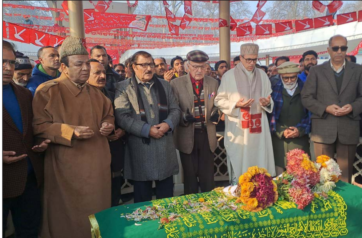
NC Vice-President Omar Abdullah along with senior party leaders paid tributes to Sheikh Abdullah on his 118th birth anniversary at his mausoleum in Nigeen area of Srinagar on Tuesday.

The DC asked the Traffic Police Department to ensure an efficient traffic management system and adequate parking facilities in and around the designated examination centers on the examination date and time. While the Police authorities were asked to ensure adequate deployment of Police personnel for escort of examination material and ensuring smooth conduct of the examination.