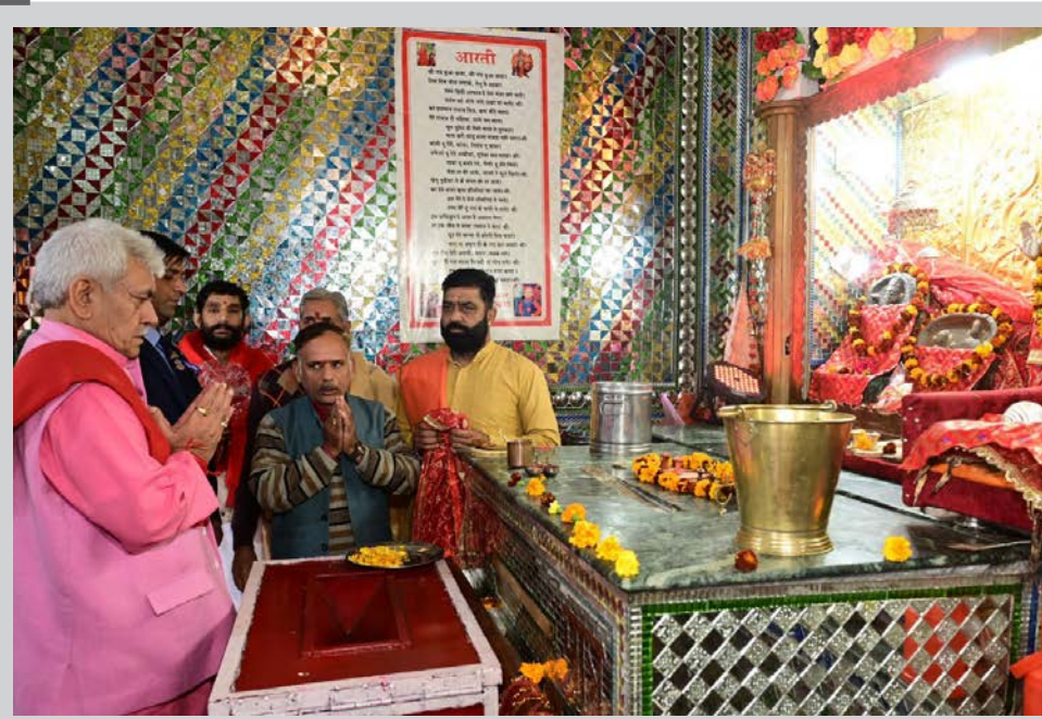
LEIUTENANT GOVERNOR MANOJ SINHA on Tuesday attended historic Jhiri Mela and paid obeisance to Baba Jitto at his Samadhi in Jhiri Village in the outskirts of Jammu city.

The case was transferred to the NIA by the Ministry of Home Affairs on June 28.