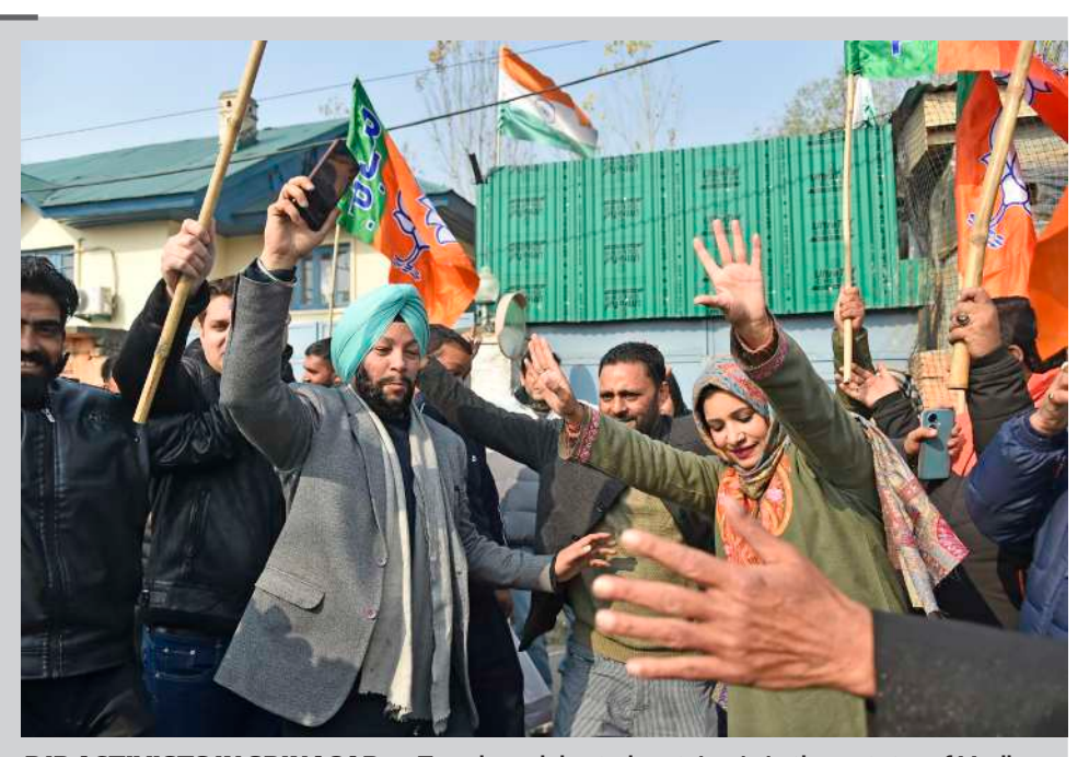
BJP ACTIVISTS IN SRINAGAR on Tuesday celebrated party's win in three states of Madhya Pradesh, Rajasthan and Chhattisgarh.