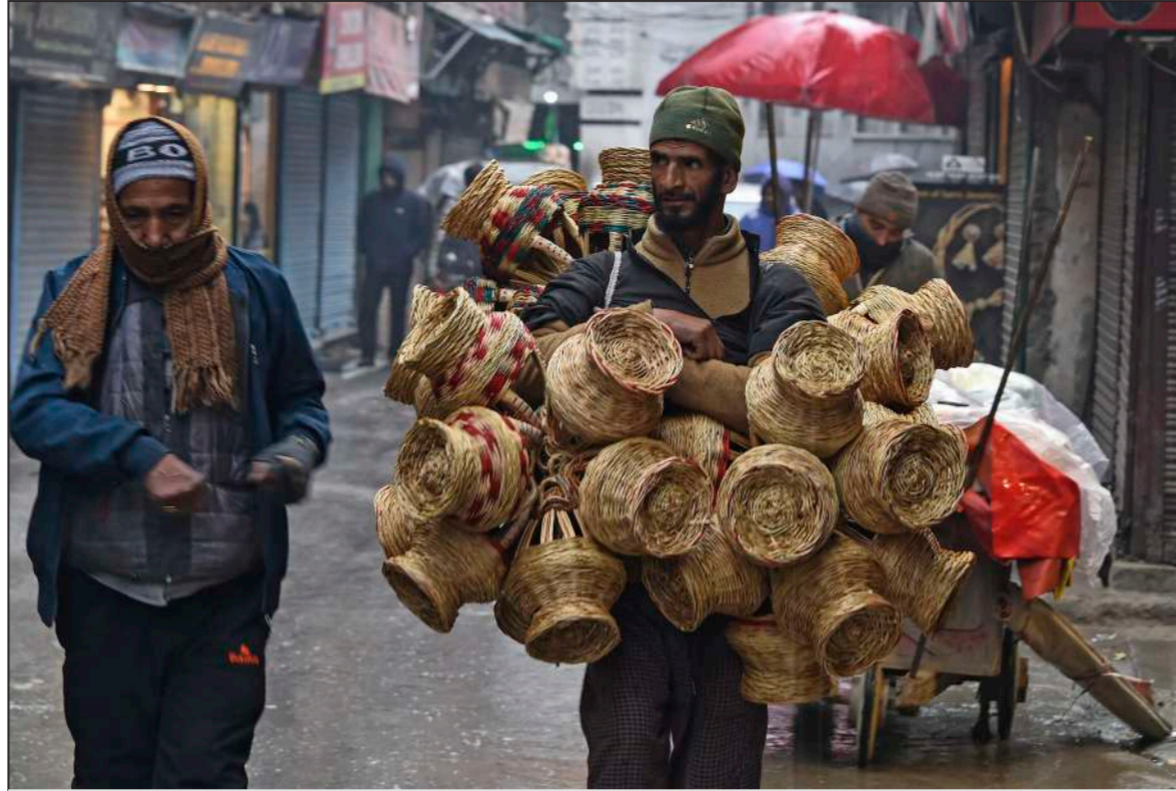
As cold weather intensified, demand for traditional Kashmiri fire pot 'Kangri' surges across Kashmir including Srinagar.