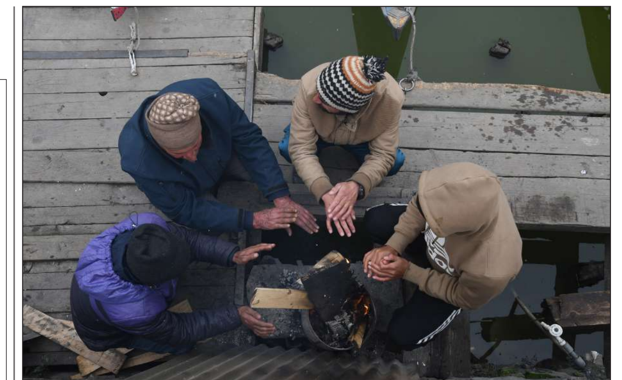
People gather around a bonfire to keep themselves warm amid intemittent light rainfall on a cold Friday afternoon at iconic Dal Lake in Sringar.

An official said they will press water pumps into service to clear the accumulated water.