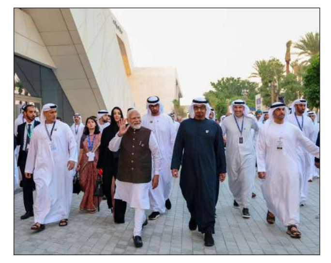
Prime Minister Modi was warmly recieved in UAE

On October 7, Israel was stormed by Hamas fighters in a deadly and surprise assault that triggered invasion of Gaza