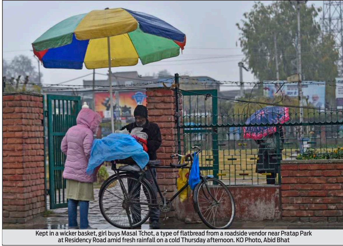
Kept in a wicker basket, girl buys Masal Tchot, a type of flatbread from a roadside vendor near Pratap Park at Residency Road amid fresh rainfall on a cold Thursday afternoon.