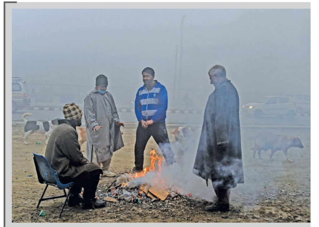
PEOPLE AT MANY PLACES lit bonfires on Wednesday to keep themselves warm from severe cold that has swept Kashmir Valley.

"Despite reflection of pleadings and legal grounds urged by the petitioner in the impugned order, learned appellate court has neither adverted to the pleadings nor addressed the legal issues to show thoughtful consideration of the controversy," the court said, adding "It is surprising to note that learned appellate court on the one hand observed that court below had violated Section 28 of the Act and then refused interference. It is absurd."