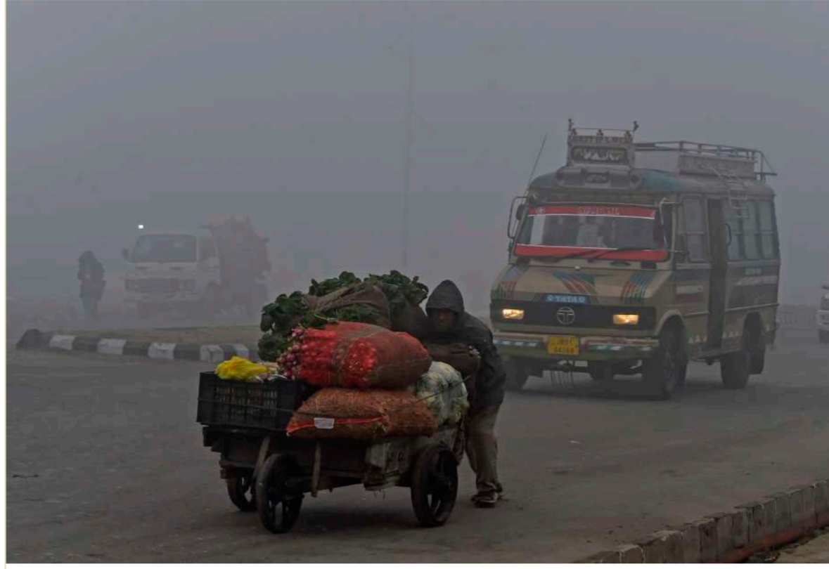
Man pushing vegetables laden handcart in city center Lal Chowk on a cold, foggy Tuesday morning.

The firefighting operation was on when the reports last came in.