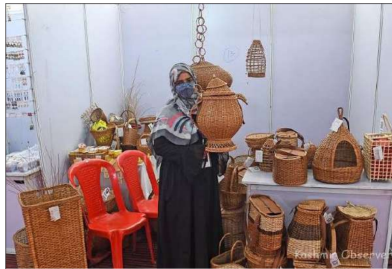
A woman artisan showcases her craft at SARAS mela in Srinagar

A path to economic self-reliance amid global uncertainties