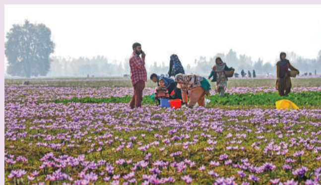
the "king of spices" in fields sprawling across several thousand hectares mainly in Pampore, have complained for years that lack of rainfall at crucial times has led to a