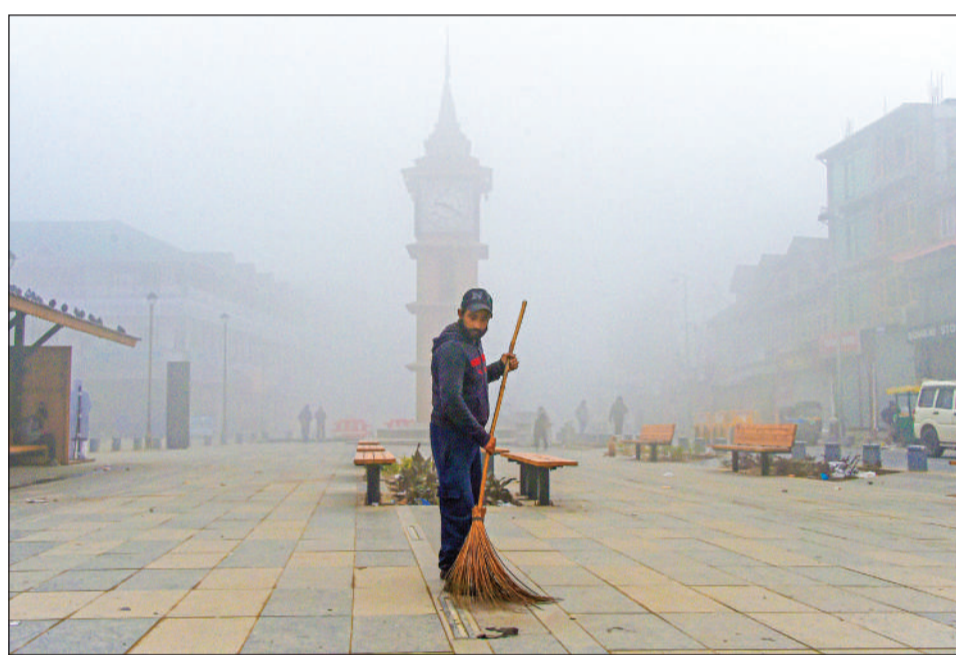
A sanitation worker cleans a street near Srinagar's clock tower on a cold and foggy Monday morning.