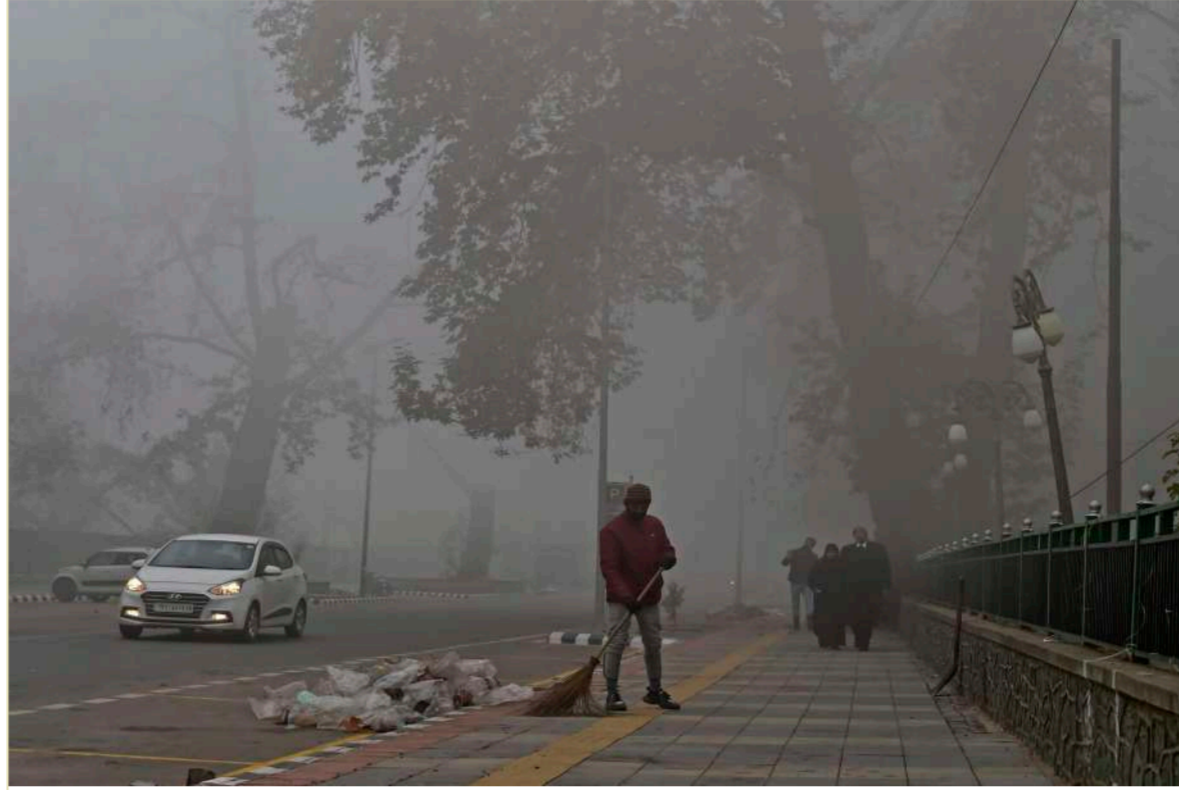
A Srinagar Municipal Corporation (SMC) sanitation worker sweeps pedestrian walkway at the Residency Road in Srinagar amidst dense fog on a cold Monday morning.

Observer News Service Srinagar: The Cooperative Department on Monday organized a mega function to wrap up the week-long celebrations of 70th All India Cooperative Week at SKICC, Srinagar.