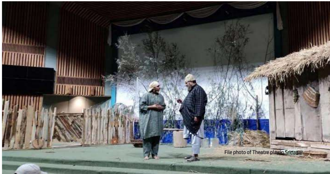
File photo of Theatre play in Srinagar

“Progress doesn’t lie in copying the Western hegemonic habits of life or art but to imbibe their scientific spirit and academic rigour without belittling our roots and without turning away from our vernacular modes of thought and experience. While we have opened our case with the performing arts of Ladishah and Bande Pather, the analysis applies to all the modes and manifestations of tradition and culture