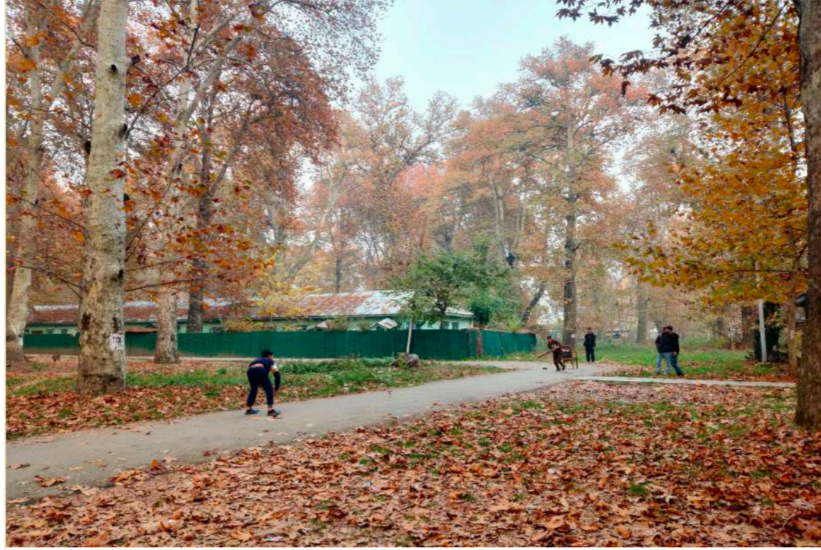
Covered with fallen leaves of chinar, children playing cricket at Naseem Bagh Park in Hazratbal area on a misty Saturday afternoon.

Mughal Gardens date back to the 16th century when Emperor Jahangir commissioned their creation and design to reflect the concept of 'Paradise on Earth'. These gardens boast a harmonious blend of Persian, Central Asian and Indian architectural styles.