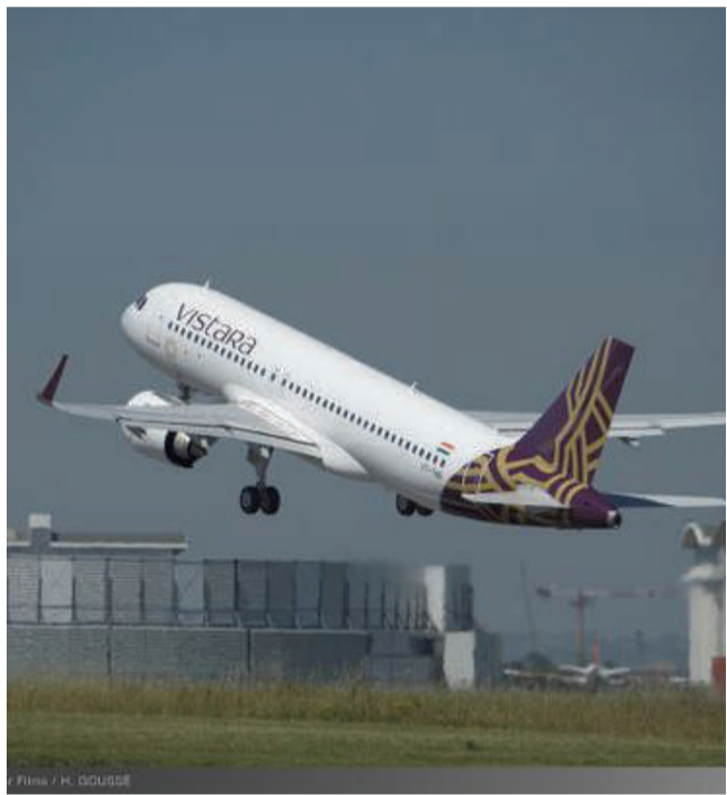
FLIGHT UK881 FROM BENGALURU TO GOA (BLR-GOI) HAS BEEN DIVERTED TO BENGALURU DUE TO RUNWAY RESTRICTION AT GOA (GOI) AIRPORT AND IS EXPECTED TO ARRIVE IN BENGALURU AT 1505 HRS."