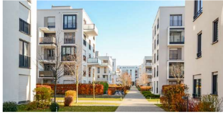
Their study is published in the journal Nature Communications. These findings differ from current common perceptions. For example, existing literature in this area has almost exclusively focused on limiting the amount of urban land development, Gao said.

The researchers said that the findings encourage researchers and practitioners to reconsider how cities are designed and built, in order to be in harmony with their natural surroundings and more resilient to climate risks.