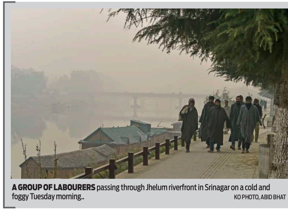
A GROUP OF LABOURERS passing through Jhelum riverfront in Srinagar on a cold and foggy Tuesday morning..