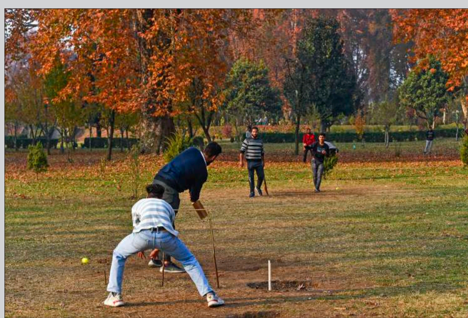
A GROUP OF BOYS PLAYING CRICKET inside Srinagar's Nishat garden where Chinar leaves have turned crimson red in the autumn season.

He said students and faculty of the university with the right kind of startup ecosystem available on its campuses are coming up with disruptive ideas for resolving the pressing problems in the surroundings including the contamination of the Dal Lake.