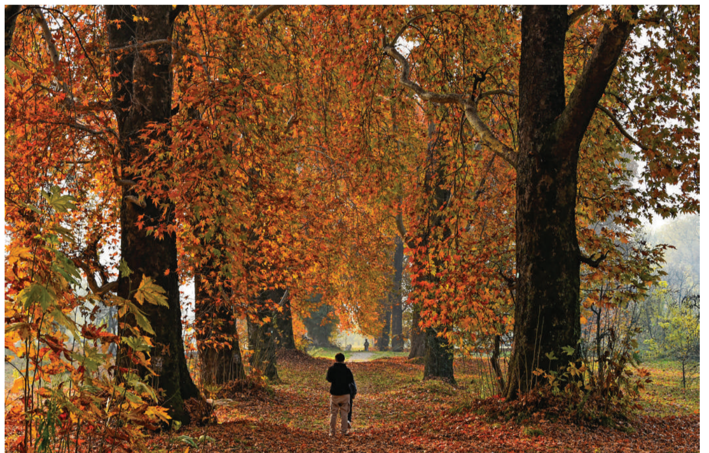
SRINAGAR'S FAMED NISHAT GARDEN presents a majestic look as leaves of mighty Chinar trees have started turning crimson red in the ongoing autumn season.