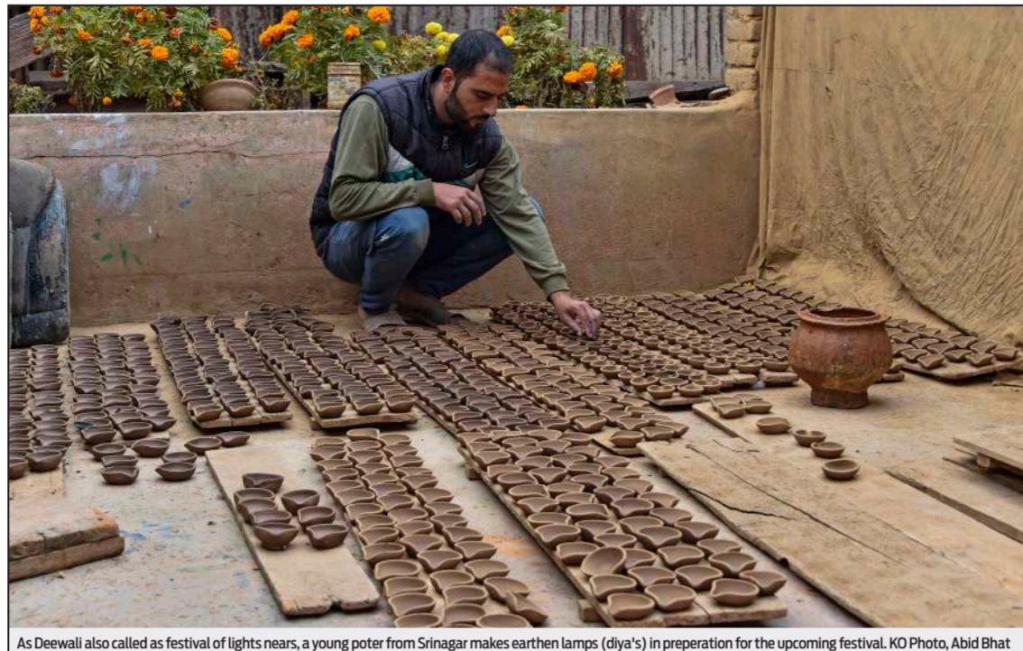
As Diwali also called as festival of lights nears, a young potter from Srinagar makes earthen lamps (diya's) in preparation for the upcoming festival.