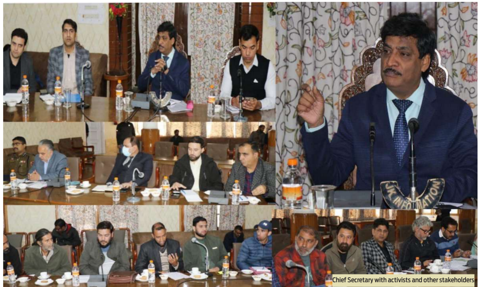
Chief Secretary with activists and other stakeholders