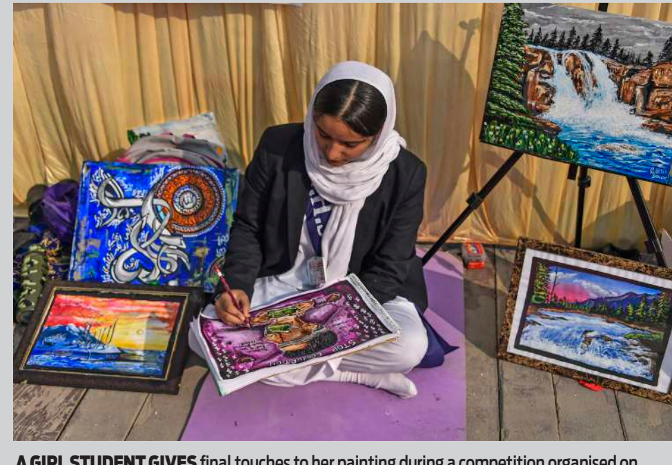
A GIRL STUDENT GIVES final touches to her painting during a competition organised on the occasion of UT Foundation Day, here at Zero Bridge on Tuesday.

The former chief minister of Jammu and Kashmir said Apple should share all the details "and after investigation, all the facts be brought before the public".