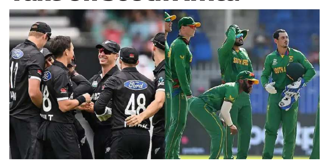
Press Trust of India

PUNE: One side endured the agony of a close defeat and other felt the ecstacy of victory in a rip-roaring game but when New Zealand and South Africa clash in a World Cup game here on Wednesday both will start on an even keel.