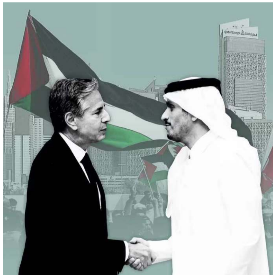
US secretary of state Antony Blinken, left, and Qatar's prime minister Sheikh Mohammed bin Abdulrahman al-Thani earlier this month

Allegedly, Doha serves as one of two main external bases for Hamas, the other is in Turkey. In this regard the Israeli government has helped too. Over the past five years it has allowed Qatar