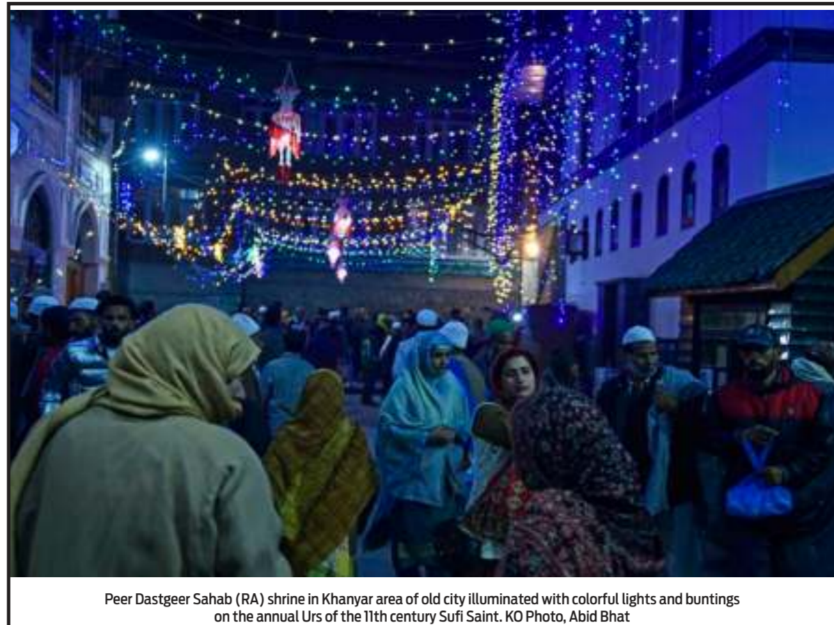
Peer Dastgeer Sahab (RA) shrine in Khanyar area of old city illuminated with colorful lights and bunting on the annual Urs of the 11th century Sufi Saint.

"We have nearly 1500 vacant seats, and we don't know where these seats are going, as we are feeling frustrated and don't understand what's happening, while we are requesting the authorities do something in this regard," the students added.