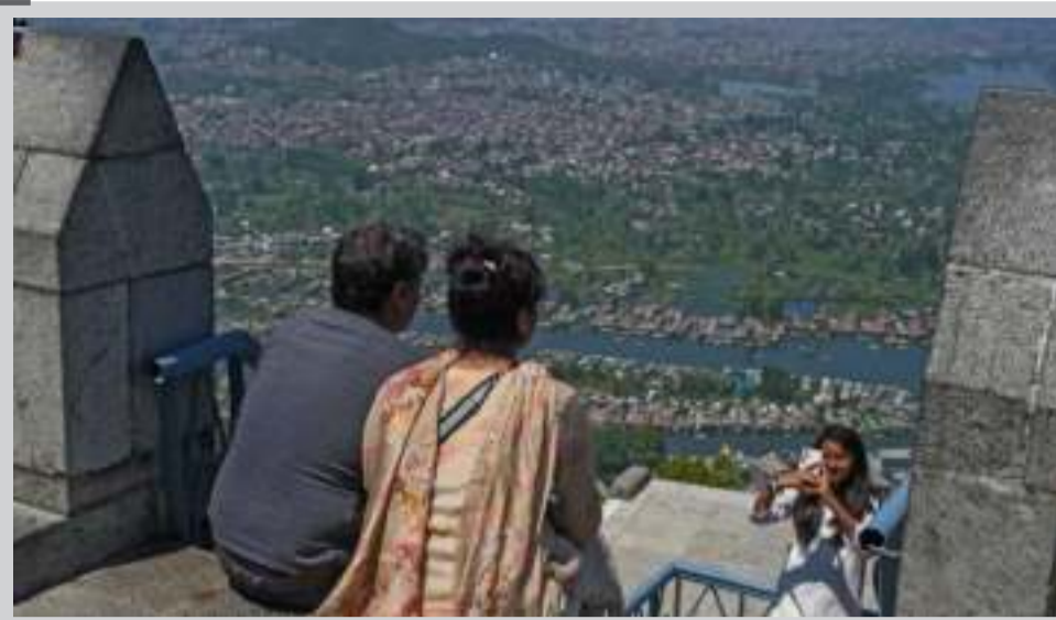
A GIRL CLICKS A PICTURE of her parents outside the ancient Shankaracharya temple with an aerial view of Srinagar, especially Dal Lake in the background.

The concerned officials of Samagra Shiksha Jammu and Kashmir has accordingly request the CEOs to instruct the Head of the Institutions (Hols) of the designated schools to finalize a suitable position and location for mounting the equipment within school premises along with availability of 6Amp AC socket preferably with uninterrupted power supply. (KNO)