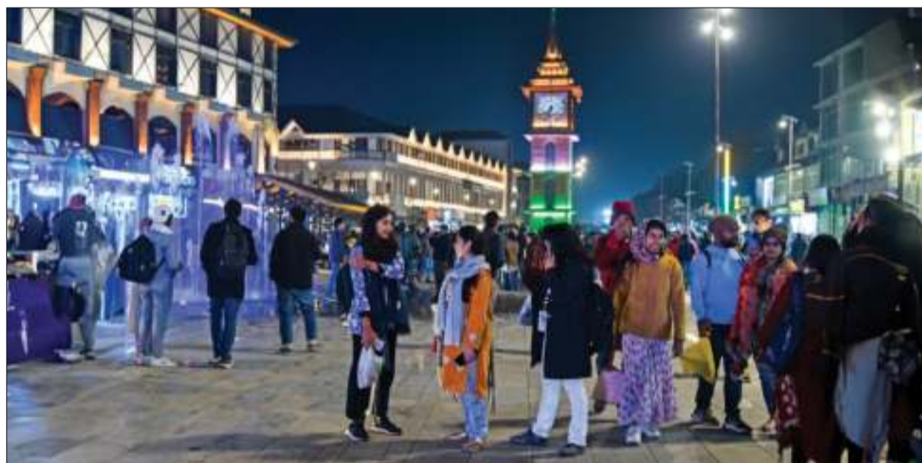
LAL CHOWK'S CLOCK TOWER has emerged as a popular hangout for locals and tourists after its renovation under the Srinagar Smart City Project.

"We are proud of the fact that in the last five years, there has been zero collateral damage during the course of actions. It is a matter of immense happiness. Law-and-order incidents have also come down to zero. By the grace of God, there has been zero civilian casualty | More on P10