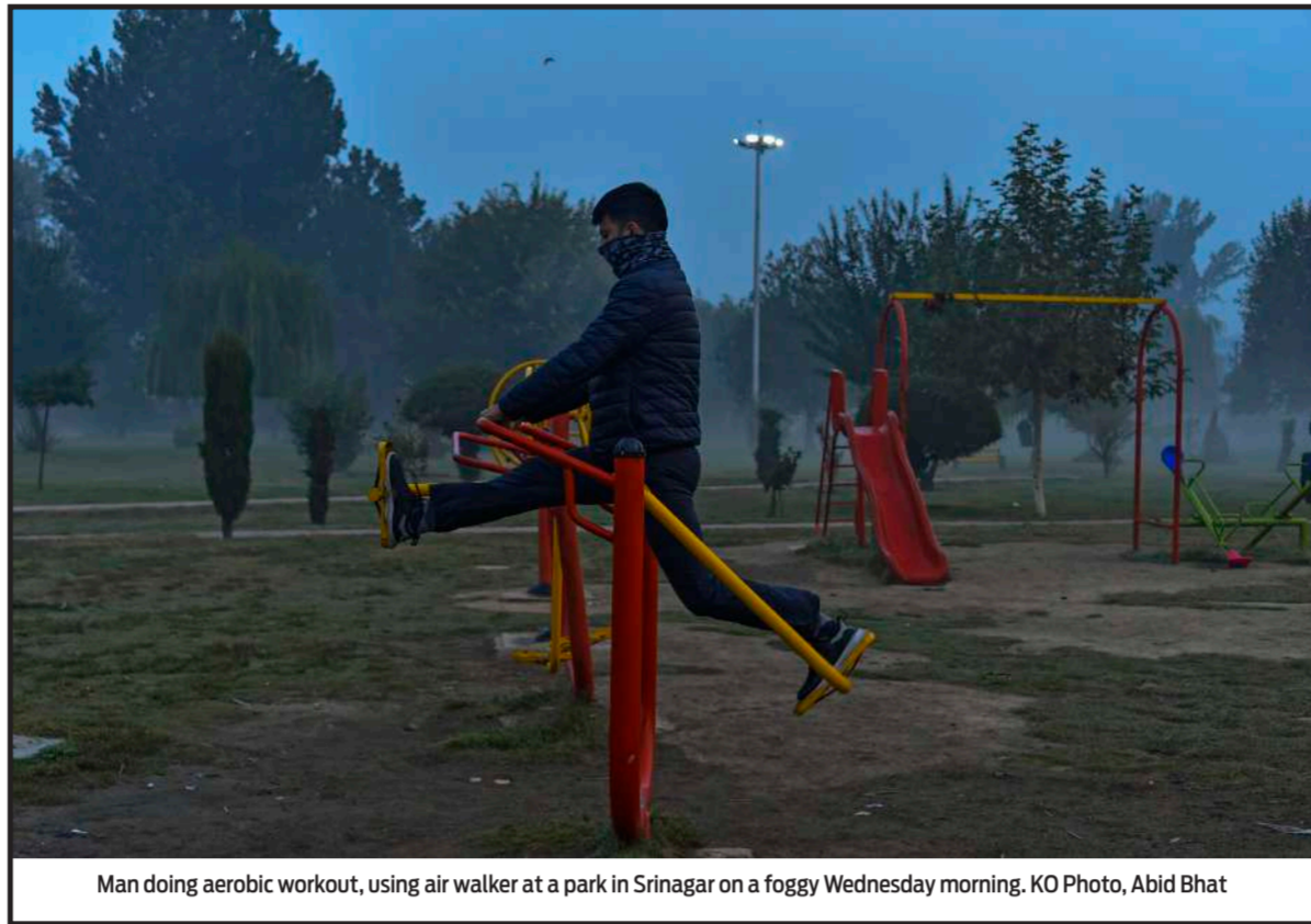
Man doing aerobic workout, using air walker at a park in Srinagar on a foggy Wednesday morning.

Meanwhile, similar cleanliness drives were also conducted across all District Information Centers in Kashmir division.