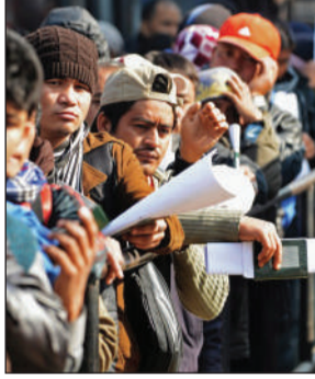
Jammu and Srinagar, and all SSPs and SPs (Foreigners Registration Office).

The members of the committee include the Foreigners Regional Registration Officer (FRRO) of Punjab, senior superintendents of police (SSPs), the Jammu and Kashmir Police's Criminal Investigation Department (Special Branch) of both