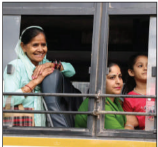
Delhi government had fixed the AMR amount at Rs 5000 per month," an official said.

"This enhancement of 170 per cent (almost 2.7 times) in the AMR comes after a long gap of 16 years, when the AMR amount was doubled from Rs 5,000 per month to Rs 10,000 per month in 2007. In 1995, the