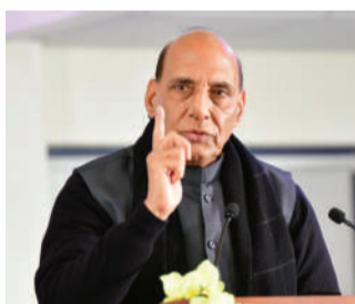
confidence in the force to effectively confront any contingency even as he noted that the ongoing talks between >> More On P10

In an address to the top commanders of the Army, Singh, referring to the situation in eastern Ladakh, expressed full