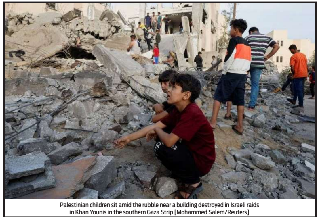
Palestinian children sit amid the rubble near a building destroyed in Israeli raids in Khan Younis in the southern Gaza Strip

The result of a conflict, including matters of morality, is seldom determined by the righteousness of a cause; rather, it is often shaped by a dominant power