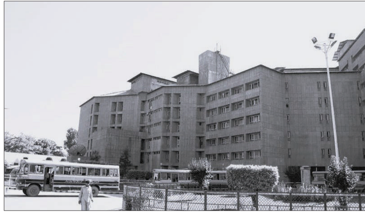
Feature image: Sher-I-Kashmir Institute of Medical Sciences.

What pains me even more, if there could be a deeper sorrow, is that my dear mother, the one who guided me through life, fell victim to a terrible infection while she was in the Neuro