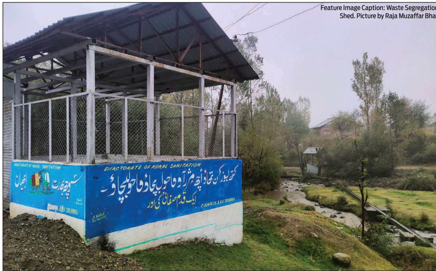
Feature Image Caption: Waste Segregation Shed.

The Rural Sanitation Department is violating its own slogans