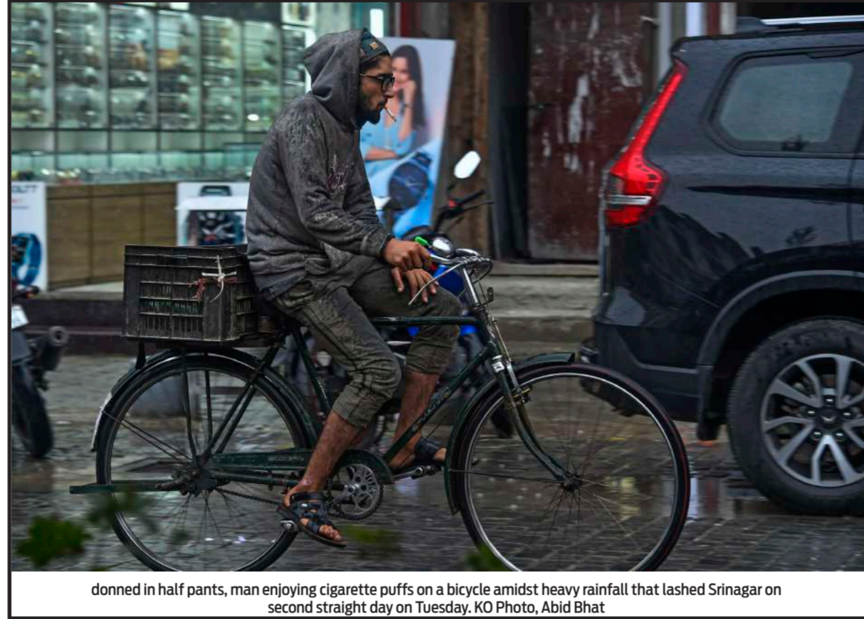
donned in half pants, man enjoying cigarette puffs on a bicycle amidst heavy rainfall that lashed Srinagar on second straight day on Tuesday.

"We demand a thorough probe into the mysterious death of our daughter. We are sure that she has not died of natural causes but was murdered in cold-blood. We appeal to the police to initiate an inquiry into the mysterious death of our daughter so the facts come to fore," a relative of the deceased woman told reporters at their residence. A police official said the police have already taken cognizance of the issue and investigation has been taken up in this direction.