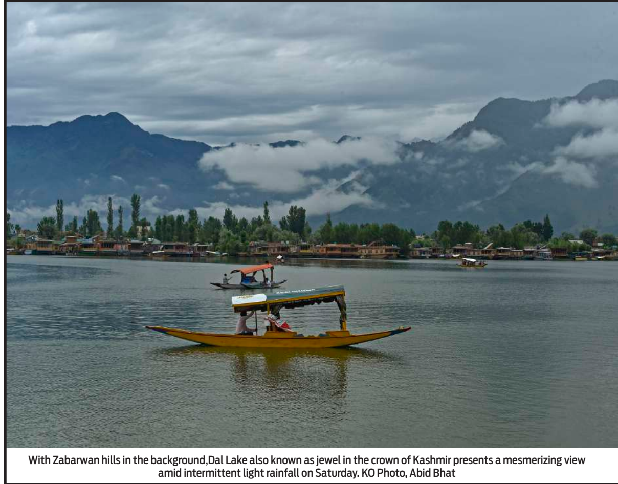
With Zabarwan hills in the background, Dal Lake also known as jewel in the crown of Kashmir presents a mesmerizing view amid intermittent light rainfall on Saturday.

Meanwhile, a special drive was carried out by the Team Food Safety Srinagar along with Intelligence cum legal cell of Drug and Food Control Organization in Jawhar Nagar, Rajbagh and adjacent areas during which a Mobile Food Testing Van was put in place to check quality food being sold in the City markets and about 60 samples were analyzed on spot.