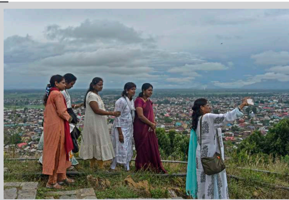
A GROUP OF TOURISTS TAKING a selfie at Srinagar's Hari Parbat fort on a warm Friday afternoon.