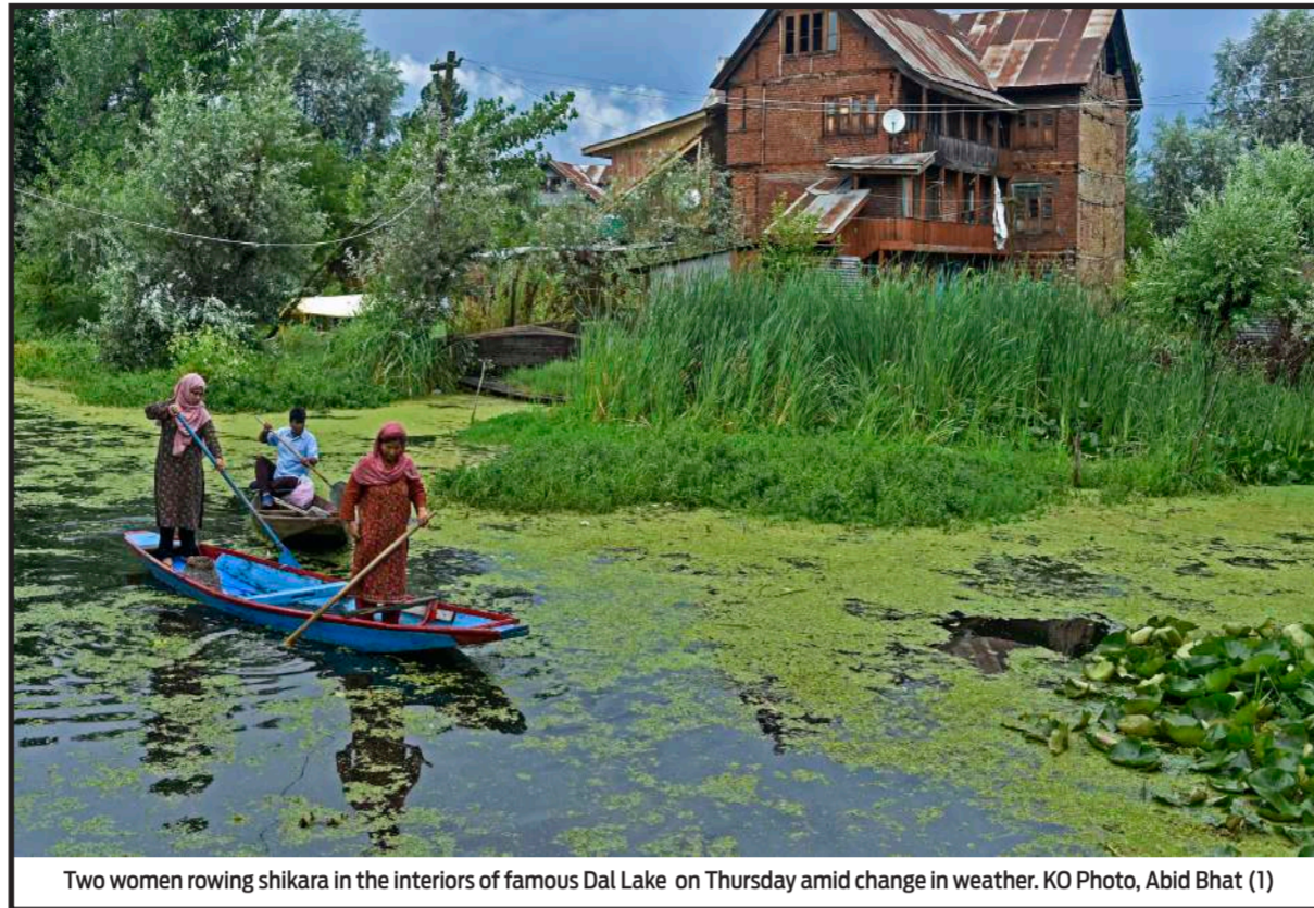
Two women rowing shikara in the interiors of famous Dal Lake on Thursday amid change in weather.