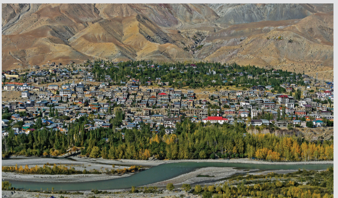
A mesmerizing view of colourful Kargil Valley, as the autumn announces its arrival in the Union Territory.

When the researchers exposed these gene-edited chickens to the flu virus, nine out of ten of them did not get infected, which is a very promising result. This is because the virus couldn't interact with the modified ANP32A More On P6