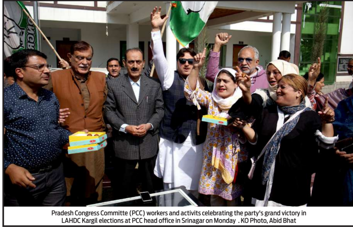
Pradesh Congress Committee (PCC) workers and activists celebrating the party's grand victory in LAHDC Kargil elections at PCC head office in Srinagar on Monday.

medical care. "Patients, especially those with children, elderly attendants, face a daunting challenge when attempting to cross the road to reach the hospital. The busy traffic and the absence of a safe pedestrian crossing exacerbate the situation, putting lives at risk," says a father, who had to cross the road with his 5-years-old ill son in lap. The other patients alleged that attendants and family members accompanying patients also endure the same hardships.