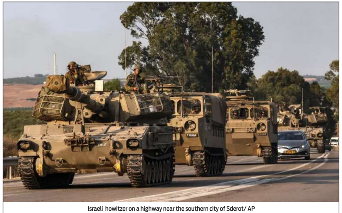
Israeli howitzer on a highway near the southern city of Sderot

Indeed the wheel of time never stops for anyone and metaphorically it also unfolds completely unthinkable or unfathomable events. Similarly, history also has a peculiar way of repeating itself. It was repeated once again after fifty years plus one day, when Hamas launched a well-coordinated and bold land, sea and air invasion into Israeli territory.