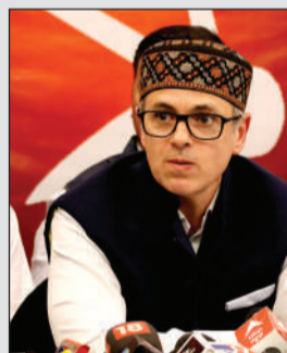
KO

National Conference Vice President Omar Abdullah on Monday said the Election Commission not announcing the poll schedule for the Jammu and Kashmir assembly can push people to take to the streets for their right to have an elected government. "It seems like we are being pushed to a situation where we have to protest even for our democratic rights," Omar told reporters here. ▶ More On P6