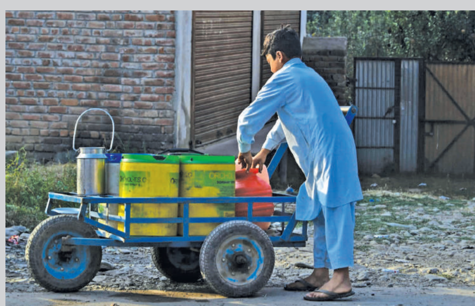
AMID A SHORTAGE OF CLEAN drinking water, a boy fills his cart with several plastic containers containing tap water in Khag area of Budgam district on Thursday.