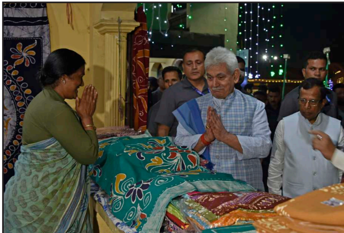
J&K Lt Governor, Manoj Sinha interacting with a woman entrepreneur after attending Sanskriti Mahotsav at Kashmir Haat on Monday.

In this regard, the Deputy Commissioner Srinagar has thanked his RDD Team and members of PRIs for their brilliant work and support to District Administration which has led to attainment of important milestones under SBM-2.0.