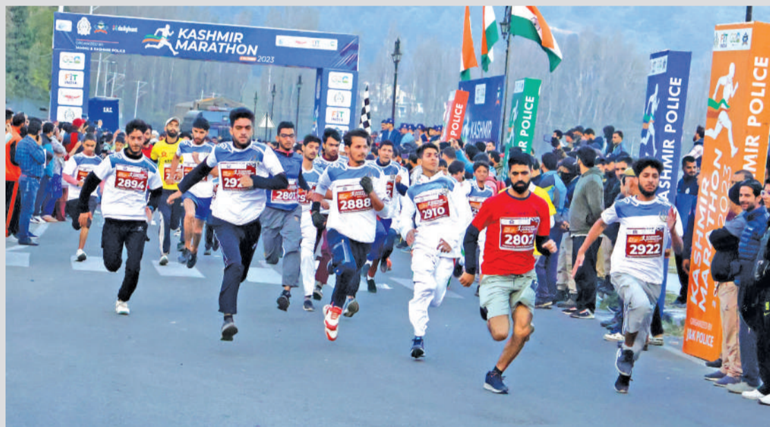
Children participate in the J&K Police-organised 'Run For Peace' mega marathon in Srinagar on Monday. The marathon route stretched from Lake View Park Golf Course to Duck Park via the picturesque Nishat-Foreshore road. Prizes worth Rs 6,52,000 were distributed among winners of 13 different categories.