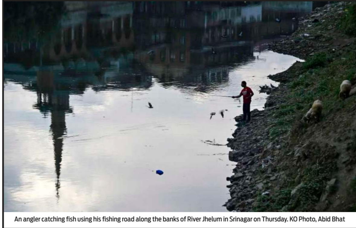
An angler catching fish using his fishing rod along the banks of River Jhelum in Srinagar on Thursday.

They have requested the higher-ups to look into the matter at the earliest so that the employees get justice.