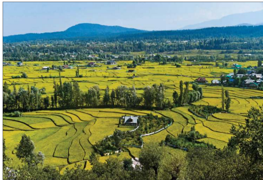
A mesmerizing view of lush green fields in Chowkibal area of North Kashmir's Kupwara district.

"The DGP emphasized maintaining high level of coordination to conduct the Yatra smoothly and said that strict adherence to security protocols be ensured for the yatra in a desired manner. ▶ More On P10