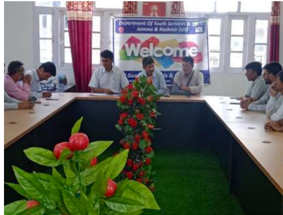
Observer News Service

ANANTNAG: The Department Of Youth Services & Sports Anantnag will host the Provincial