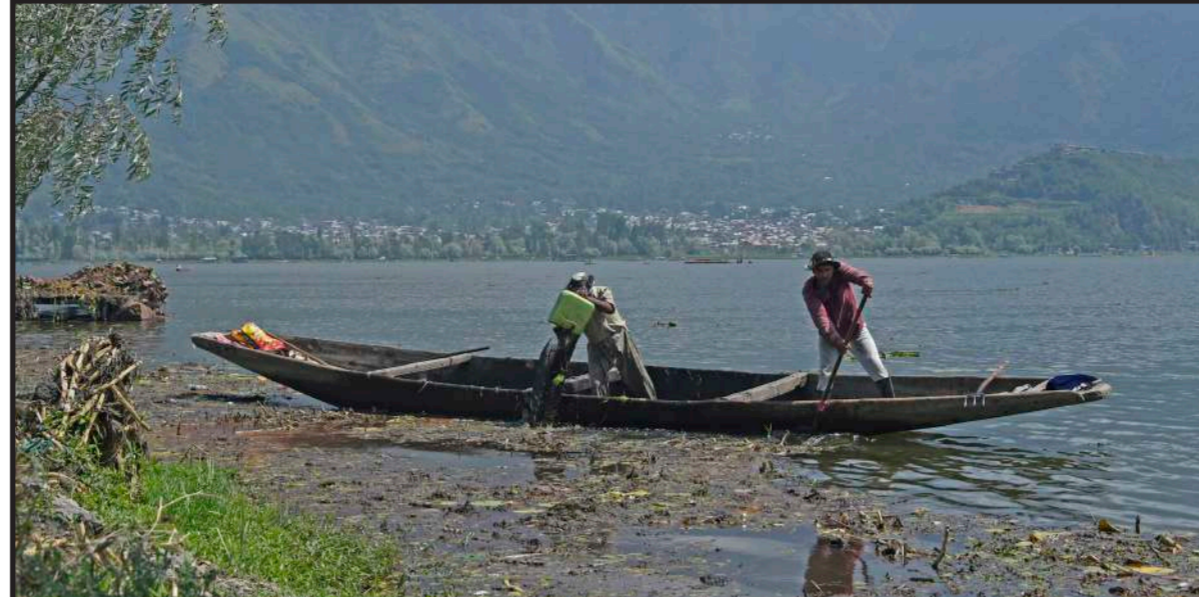
Man taking out water from his shikara in the interiors of world famous Dal Lake amid scorching heat on Friday.

Nonetheless, locals while speaking to KNO expressed anguish over the authorities' decision and described it as a nonsensical move, while urging the authorities to refrain from such actions.