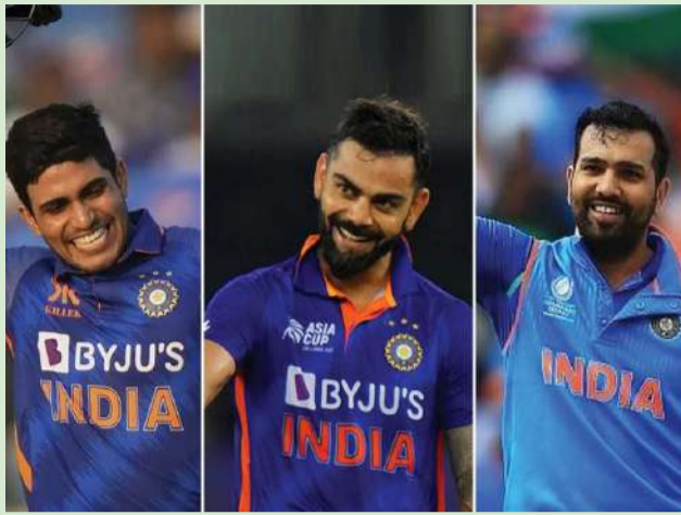
chart released by the global cricket body.

Last time, three Indian batters were in ODI's top-10 list, it was way back in January 2019. At that time, Rohit, Kohli and out-of-favour veteran Shikhar Dhawan were the three batters. Gill, who had scored 58 and figured in a 121-run opening partnership with Rohit Sharma in the Asia Cup match against Pakistan, has moved up one spot while Indian skipper and Kohli have gained two places each in the latest