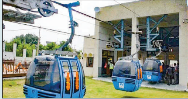
planned for construction in Jammu and Kashmir. During the same period, the department will construct

Over 2,265 kilometers of new expressways, 2,900 kilometers of major district roads and 14,150 kilometers of other district roads/village roads are