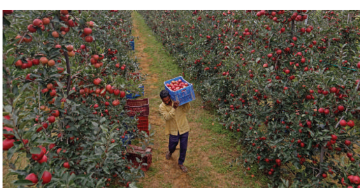
1.9 million metric tons of apples, the highest in the country.

The horticulture sector plays an important role in the Union Territory and contributes significantly to its economy. In 2019, Kashmir produced about