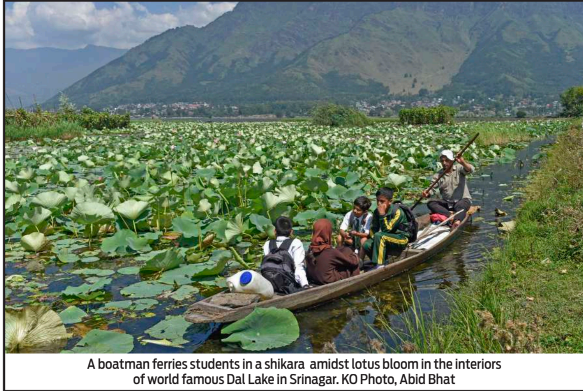
A boatman ferries students in a shikara amidst lotus bloom in the interiors of world famous Dal Lake in Srinagar.