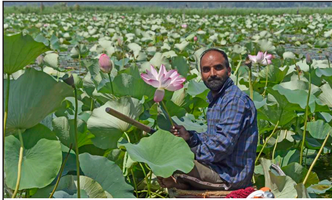
A boatman posing for a photo holding Lotus in his hand in the interiors of Dal Lake in Srinagar.