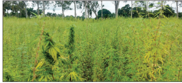
in Jammu and Kashmir Speaking exclusively to Kashmir Observer Director CSIR-Indian Institute of

THE OPERATIONAL FRAMEWORK HAS BEEN ESTABLISHED. In this mechanism, the CSIR will provide funding for the foundational research. When addressing safety and toxicological studies, DBT will offer its support."