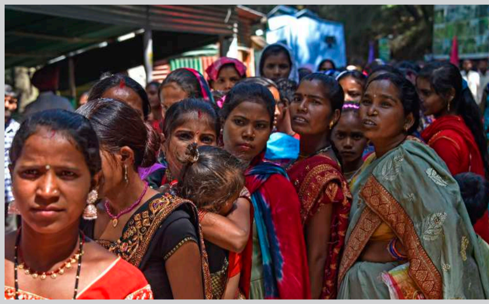
WOMEN IN QUEUE WAIT FOR their turn to pay obeisance at the Shankaracharya temple in Srinagar on the eve of Raksha Bandhan on Wednesday.