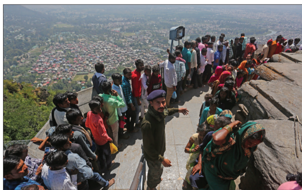
A security personnel regulates crowd of devotees that thronged Shankar Acharya temple in Srinagar on Wednesday on the eve of Raksha Bandhan.

The 145-kilometre Chhari Mubarak yatra starts from Dashnami Akhara in Srinagar and during the route, the sages perform hawans at Pampore, Bijbehara, Anantnag, Mattan, Aishmuqam and ➔ More On P10