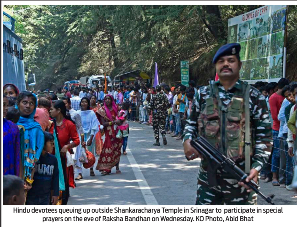
Hindu devotees queuing up outside Shankaracharya Temple in Srinagar to participate in special prayers on the eve of Raksha Bandhan on Wednesday.

"Adequate arrangements were put in place by the administration," he said.