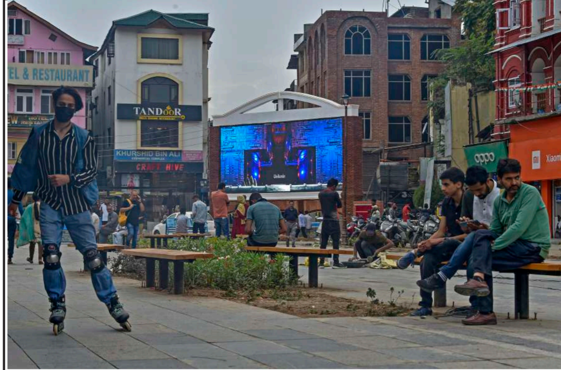
A roller skater performs stunts at City Square Lal Chowk amid moderate climate on Saturday.

"We have gone to the authorities many times, but nothing happened. We are again requesting the authorities to kindly look into the matter as urgently as we have no water supply in our area," they added.