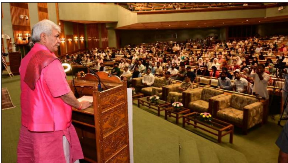
Lt Governor Shri Manoj Sinha today addressed the Medhavi Chhatra Samman Samaroh organized by Amar Ujala Group in Srinagar

Addressing the gathering, the Lt Governor called upon the Premier Education Institutions of J&K to take the lead in environmental protection campaigns.