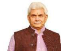
LIEUTENANT GOVERNOR JAMMU & KASHMIR

According to a Lung India study, Lung Cancer in Kashmir Valley, in which a ▶ More On P6