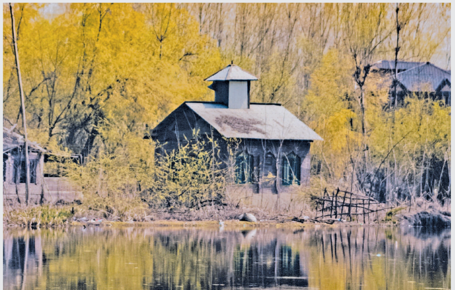
A solitary hut rests amidst vivacious foliage, surrounded by the famous Nigeen Lake.