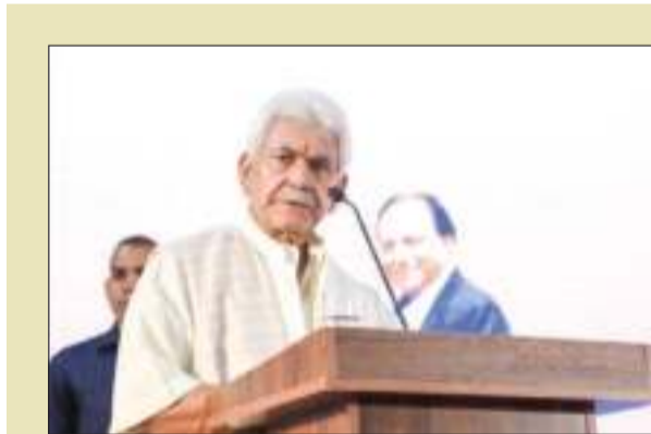
'Kashmir Turning Into Mini-Europe'

"The number of new enterprises in small towns is