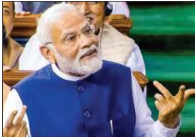
KASHMIR WAS BURNING In The Fire Of Terrorism, But The Congress Government Did Not Believe The Common Man.

fielding was laid out by opposition, but fours and sixes were hit from here (treasury benches). The opposition is bowling only no-balls in the no-confidence motion," Modi said.