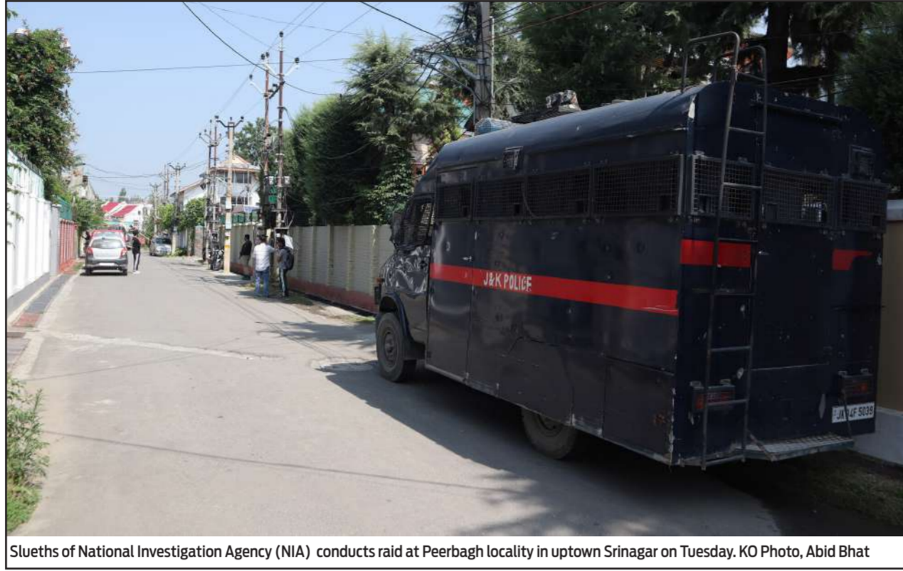
Slueths of National Investigation Agency (NIA) conducts raid at Peerbagh locality in uptown Srinagar on Tuesday.

He expressed gratitude to the youth of Jammu and Kashmir for participating in the rally.