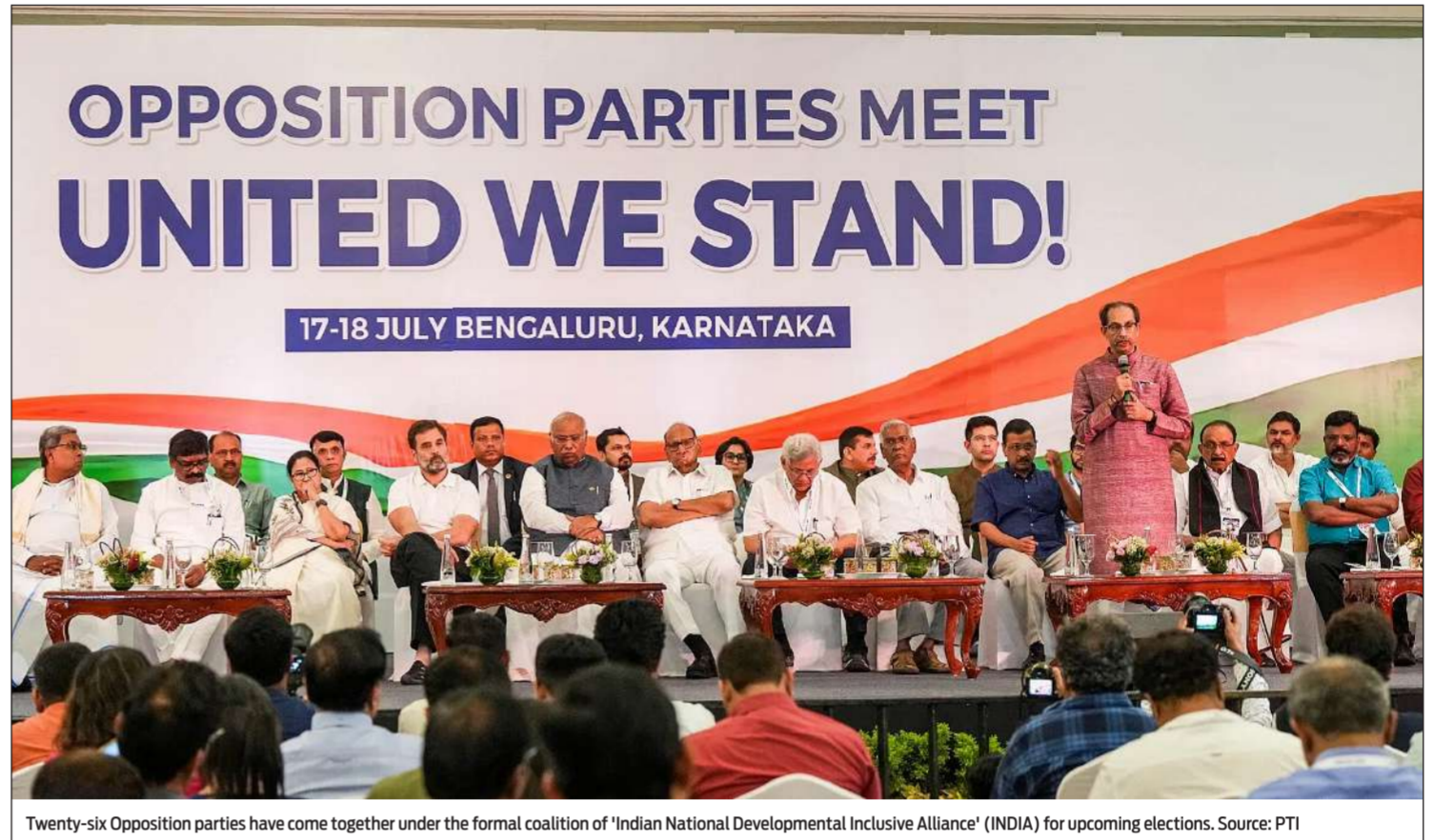
Twenty-six Opposition parties have come together under the formal coalition of 'Indian National Developmental Inclusive Alliance' (INDIA) for upcoming elections.

The opposition alliance appears to be a credible challenger to the ruling BJP, at least on paper