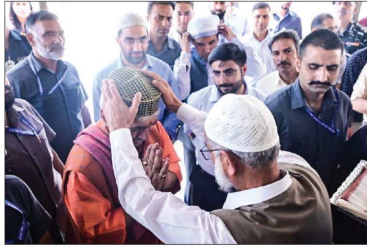
6 SHAIKH-UL-AALAM'S LIFE IS BEST EXAMPLE OF INDIA'S UNITY IN DIVERSITY. His teachings of brotherhood, love, harmony continue to inspire the world."

said the UT administration is working with the right intent to meet the developmental needs and aspirations of the people. He assured that