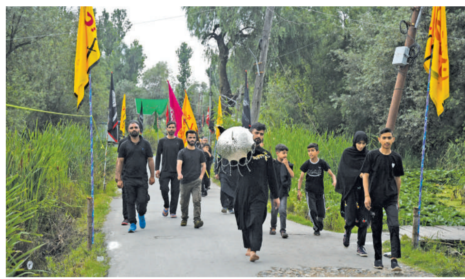
MOURNERS CARRYING ALAM-SHAREEF in the interiors of Dal Lake, where a procession is taken out in boats on the ninth day of Muharram every year.

The Director mentioned that apart from the mentioned initiatives, NIT Srinagar has been implementing several other academic reforms. Notably, the institute has integrated Enterprise Resource Planning Software (ERP) for streamlined management of students, starting from admission procedures to the conferral of degrees.