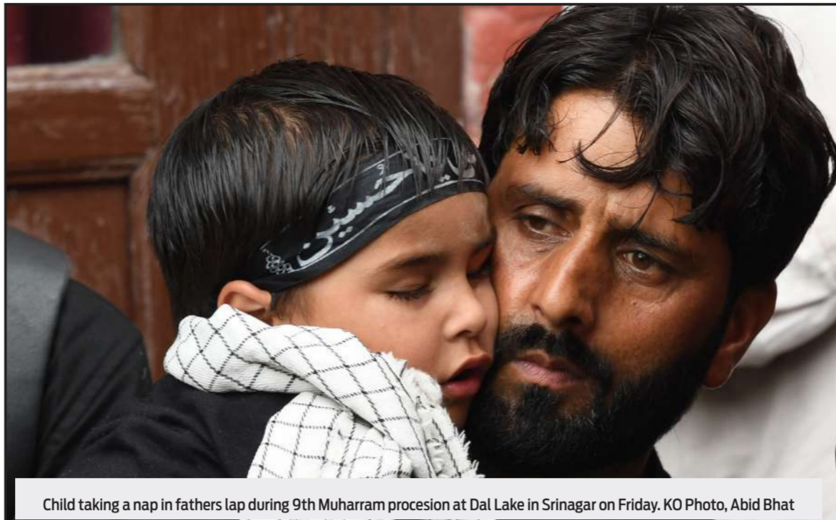
Child taking a nap in fathers lap during 9th Muharram procesion at Dal Lake in Srinagar on Friday.

The convocation is likely to be held in the near future and in this regard the university's administration has already started making preparations.