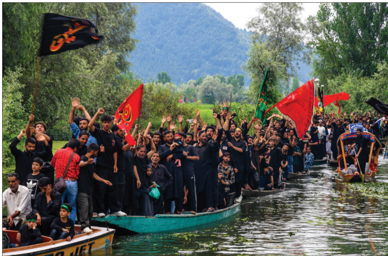
Hundreds of mourners in the interiors of Dal Lake on Friday took out a procession in boats on the ninth day of the holy month of Muharram.

During the course of the investigation, the SIA Kashmir has also identified 188 properties which were either in possession or registered in the name of unlawful association Jel-JK, out of which identified 188 properties, out of which 58 properties, More on P6