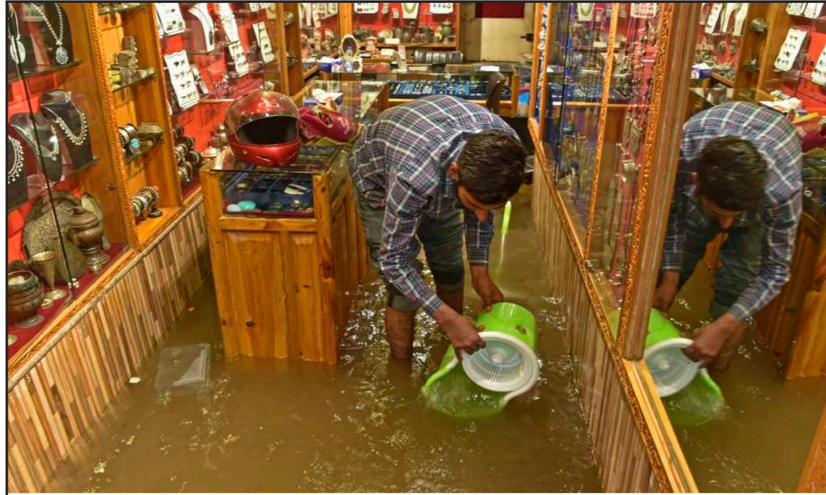
A shopkeeper at newly renovated Polo View Market removes water which might have seeped into shops at the trendy market due to leakage in drain.

"Please don't be misled, the market has not been inundated. Srinagar has a drainage issue and water logging takes place at a number of places. But at Polo View, there is no drainage issue," Aamir Athar Khan said.