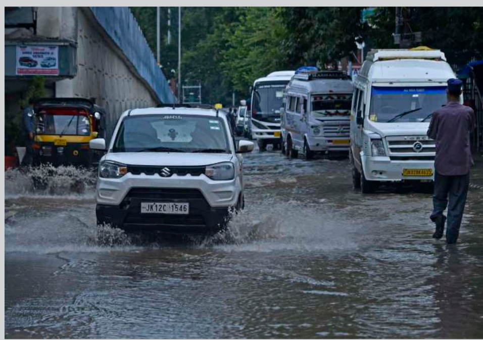
MANY ROADS AND STREETS in Srinagar remained inundated after heavy rainfall during the wee hours on Tuesday.