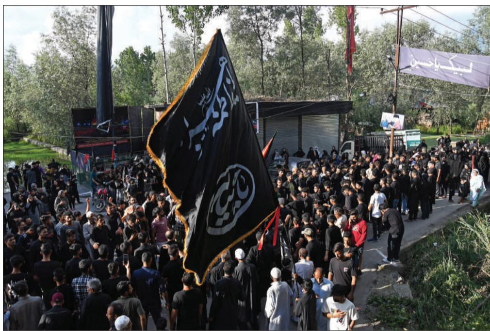
Thousands of mourners took out a procession on the sixth day of Muharram in the interiors of Dal Lake.

take any chances as far as law and order in Srinagar and elsewhere in Kashmir is concerned," the officer added.