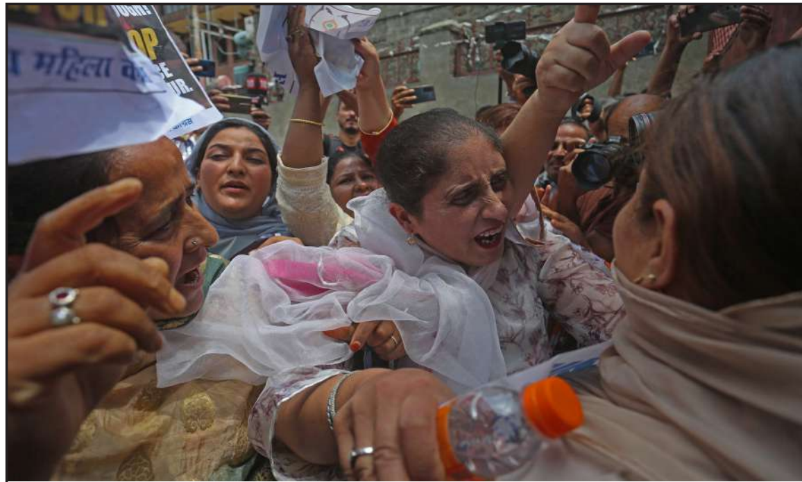
POLICE FOILS MAHILA CONGRESS workers protest in Srinagar against Manipur incident on Friday.