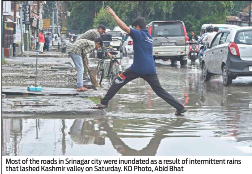
Most of the roads in Srinagar city were inundated as a result of intermittent rains that lashed Kashmir valley on Saturday.

The DC also stressed on making fool-proof security arrangements in and around the Stadium to ensure hassle-free celebrations of the function. He also enjoined upon the officers to maintain close coordination with each other for holding the function smoothly.