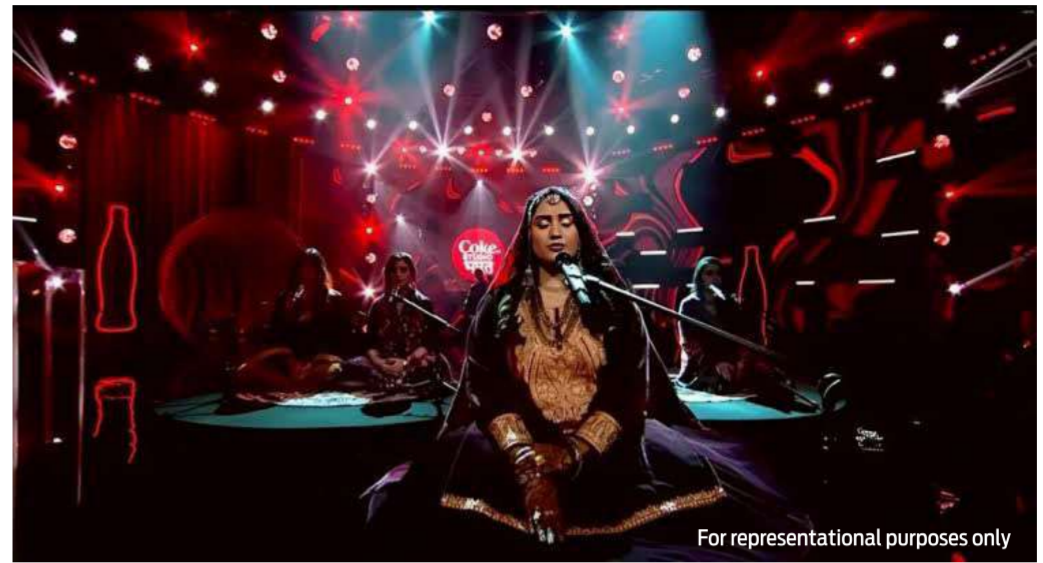
For representational purposes only

Thus, at a time when our traditional attire has undergone major editing, when our poetry has evolved from Vaakh to modern Ghazal and when our eating habits have changed from dried vegetables to pizza and others, the change in Music is, but natural. The past decade in particular has seen the rise of singers and musical genres which radically break away and depart from