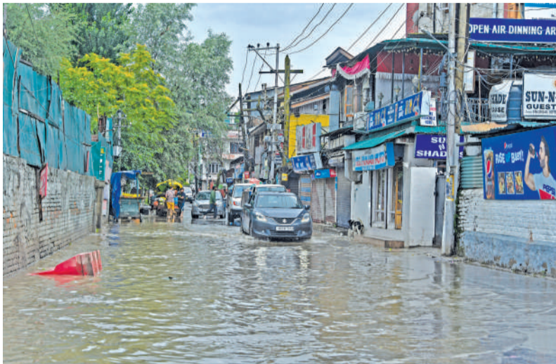
A VIEW OF INUNDATED ROAD in Srinagar on Saturday

"Police under supervision of SDPO, Damhal Hanjipora and officials of district administration Kulgam immediately rushed to the spot and