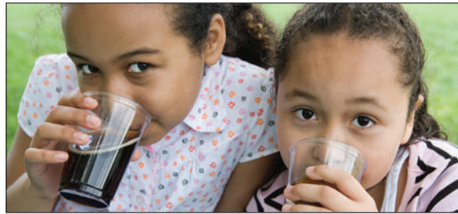
gaining unhealthy weight that eventually causes diabetes.

People hooked to aerated drinks containing harmful ingredients including phosphoric acid, caffeine, sugar and aspartame may end up