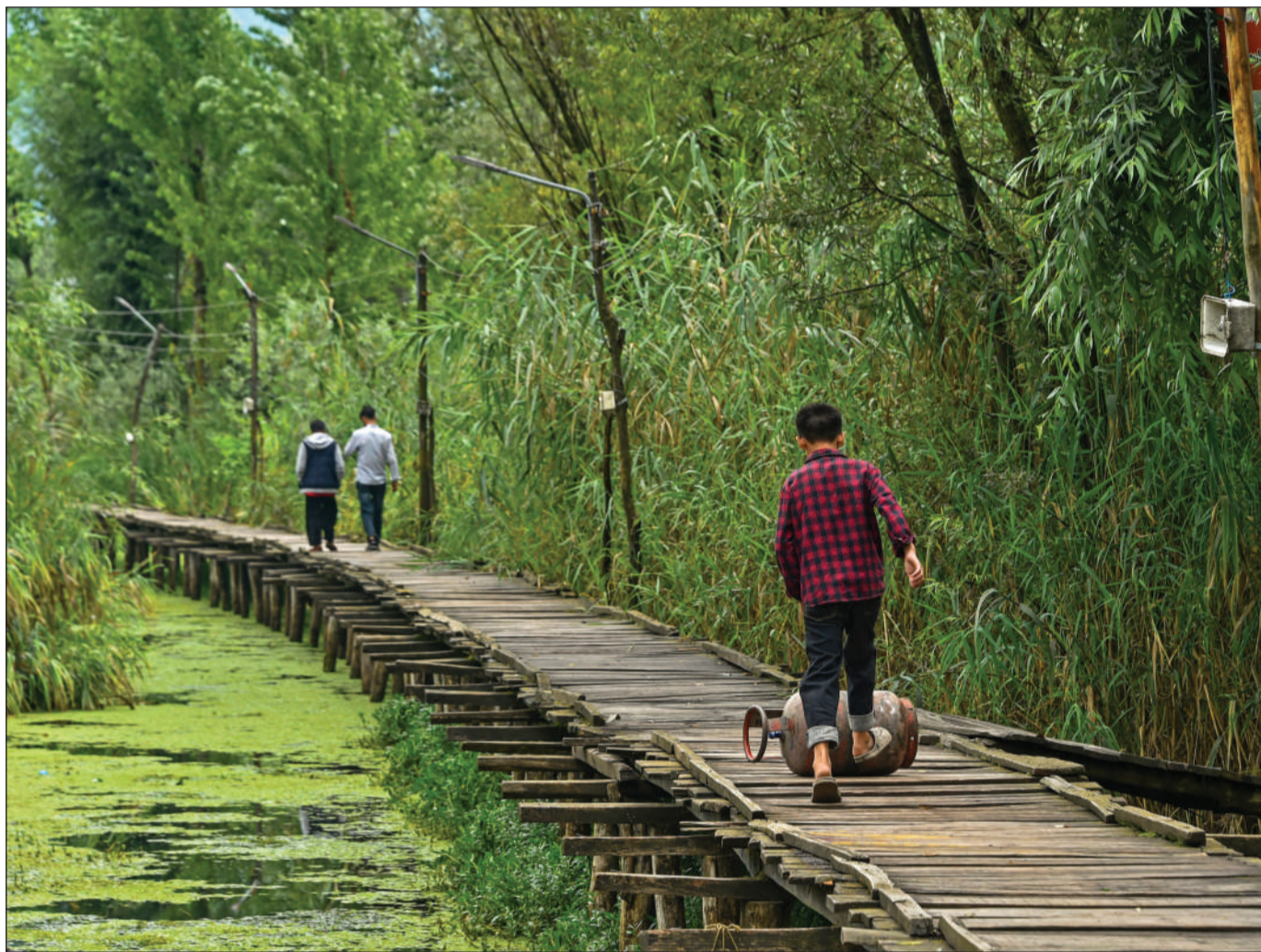
A boy pushing an LPG cylinder with his foot through a long wooden bridge in the interiors of Dal Lake on Thursday.

"Yes the Curfewed Night and another collection of poetry have been deleted from M.A English More on P10