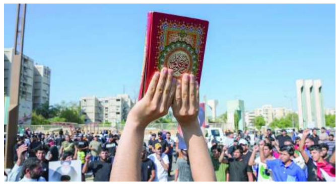
Desecration of Holy Qur'an